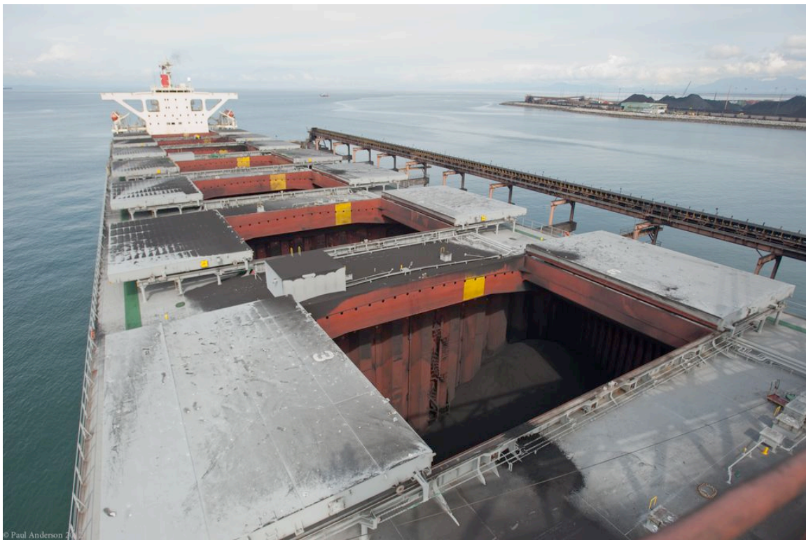
Fig. 1. Coal dust on deck of a bulk carrier being loaded at the Westshore Terminals in Delta, British Columbia.

Actual experience from other coal terminals has shown that these losses at the piers are the dominant contribution to the coal dust that enters adjacent waters. A close parallel to the MBTL ship-loading process can be found at the Westshore Terminals in Delta, British Columbia, at which the photograph in Fig. 1 was taken. Note especially