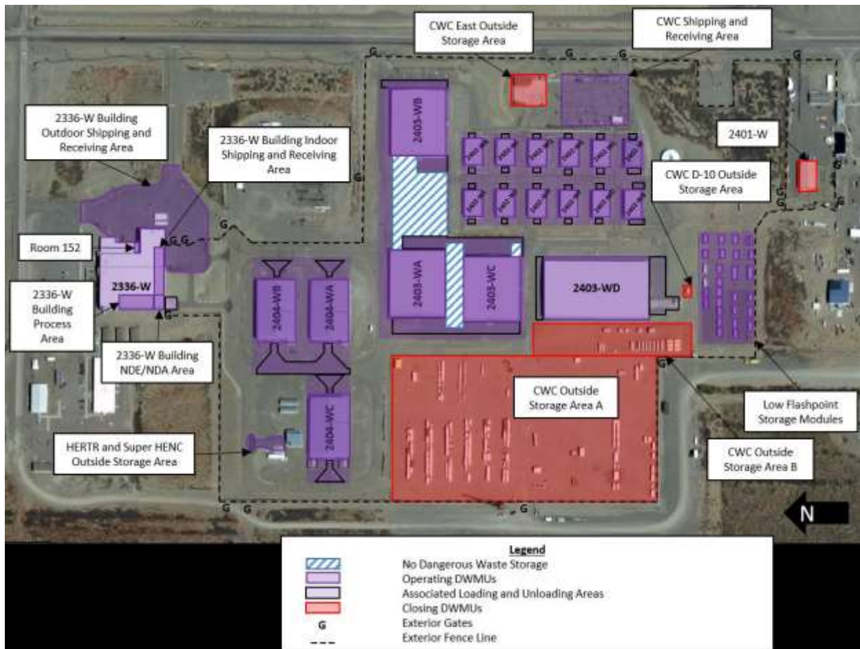
Figure 2 from RCRA Fact Sheet showing Central Waste Complex (CWC) and Waste Receiving and Processing (WRAP) facilities and Dangerous Waste Management Units (DWMUs).

USDOE illegally built and stored waste in these buildings / units without ever having applied for permits. This was a potential criminal violation. Despite being ordered to close several units with submission of “closure plans” in 2011 and 2013, the units remain unclosed. Ecology has failed to include closure of these illegally opened and operated units in the permit; and failed to order that the illegally stored wastes be characterized, treated and removed for disposal. Heart of America Northwest commented in 2014 that the USDOE should be ordered to characterize, remove and treat all wastes within three years – for which commercial treatment capacity existed. RCRA and state hazardous waste law bars accumulated storage of dangerous wastes for extended periods when treatment is available. Heart of America Northwest comments that all wastes should be included in a permit condition and order to be characterized, removed and treated by 2023, which would be nine years after the issuance of the EPA findings of violation (quoted below).