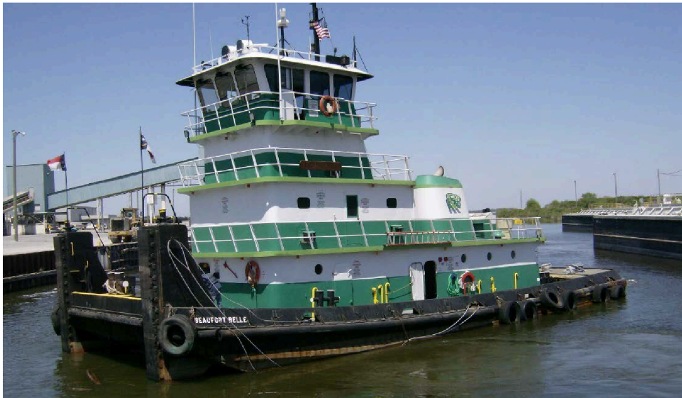
EMD 645FB 1042+ upgrade kit w/ NOx reduction

Caterpillar has a very large selection of emission reduction solutions for marine under Eligible Mitigation Actions of Appendix D-2, section (4)(d)(1). Marine repowers have the best cost effectivity due to their continual rate of use.