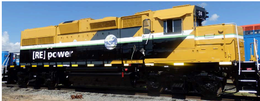
Remanufacture Switch Locomotive EMD24 to Tier 4

Washington has approximately 177 switcher locomotives in the State that have various reduction options available under the Eligible Mitigation Actions of Appendix D-2, section (3)(d)(1).