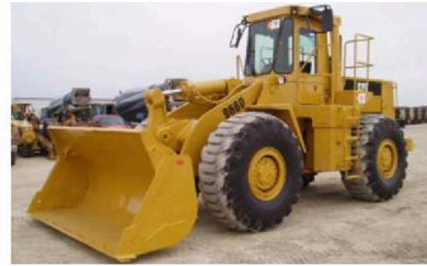
966 Loader, Unregulated to Tier 4