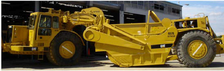
657 Scraper, unregulated to Tier 4 (dual engine)