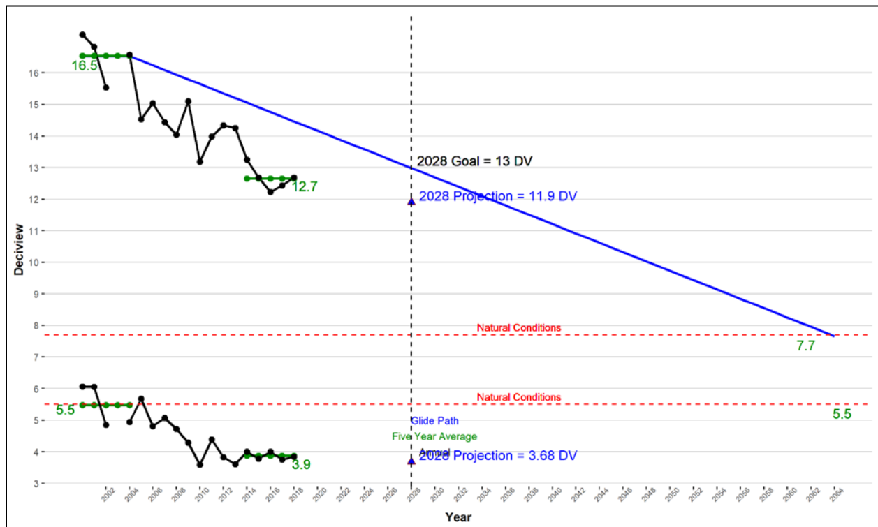
Figure 4: Projected 2028 visibility conditions on the MID in Mount Rainier National Park

Visibility conditions at Mount Rainier National Park are monitored at the IMPROVE site MORA1. The monitored 2000-2004 baseline conditions at this site on the MID are 16.5 dv and calculated natural conditions are 7.7 dv, a difference of 8.8 dv. This second RH SIP covers the second implementation period, 2018 to 2028. WRAP modeling projects a 2028 visibility RPG of 11.9 dv which is 4.6 dv less than the baseline. The uniform rate of progress or glidepath value to natural conditions in 2064 is 13.0 dv in 2028.