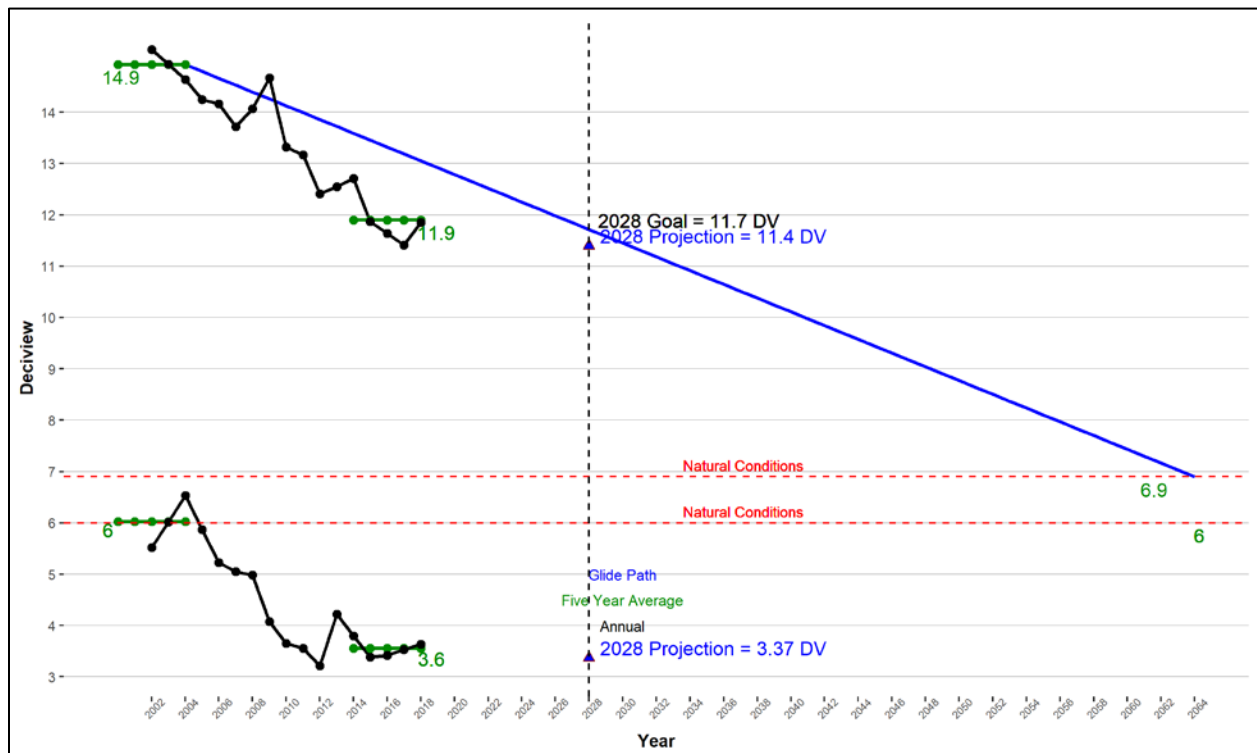
Figure 1: Projected 2028 visibility conditions on the MID in Olympic National Park

The monitored 2000-2004 baseline visibility at this site on the most impaired days (MID) is 14.9 dv and calculated natural conditions are 6.9 dv, a difference of 8 dv. This second RH SIP covers the second implementation period 2018 to 2028. The 2028 seasonal progress goal (RPG) is projected to be 11.4 dv, which is a visibility improvement of 3.5 dv from the baseline. The uniform rate of progress or glidepath value is 11.7 dv in 2028.