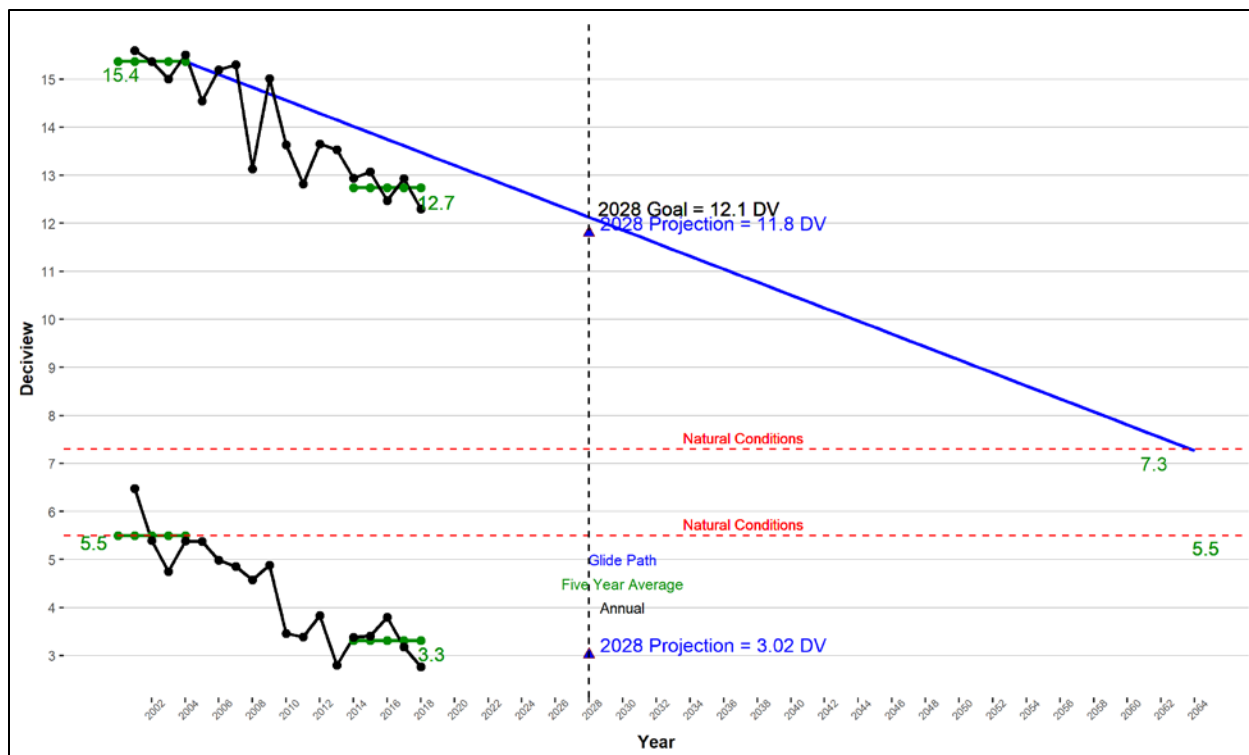
Figure 3: Projected 2028 visibility conditions on the MID in Alpine Lakes Wilderness