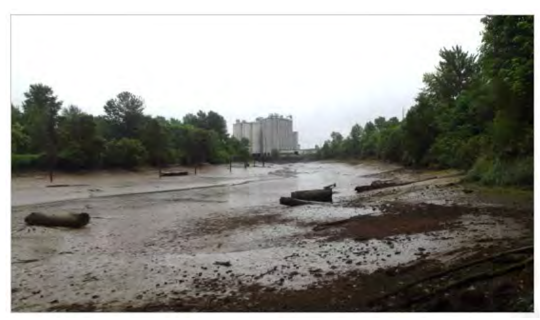
Figure 3. Intertidal mudflat, southwest perspective, between Terminal 107 and Kellogg Island, illustrating restored riparian vegetation at right, but without intertidal marsh vegetation.

PORTfolio projects include designated areas featuring one or more HEA habitat type. To estimate annual carbon sequestration rates for each PORTfolio project, the per-unit-area numbers derived from the literature review were applied to the area of each habitat type in the project.