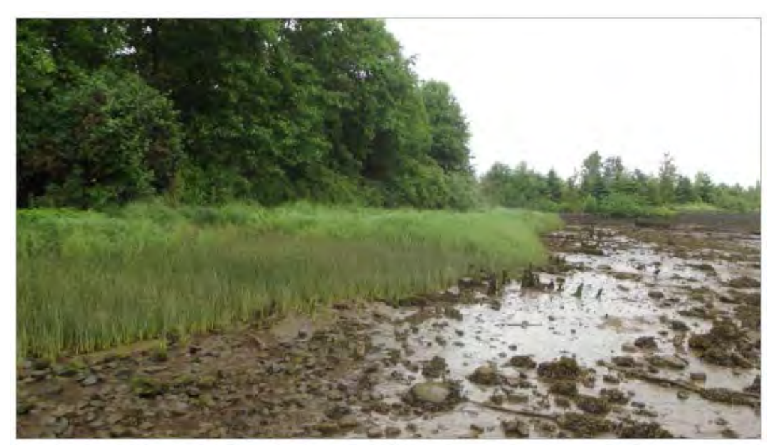
Figure 2. Restoration at Terminal 107, northwest perspective, illustrating restored conditions with established intertidal marsh and riparian vegetation in formerly un-vegetated and invasive plant area.