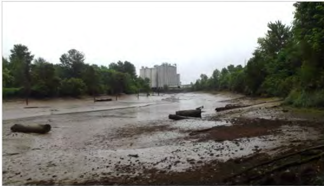
Figure 3. Intertidal mudflat, southwest perspective, between Terminal 107 and Kellogg Island, illustrating restored riparian vegetation at right, but without intertidal marsh vegetation.

PORTfolio projects include designated areas featuring one or more HEA habitat type. To estimate annual carbon sequestration rates for each PORTfolio project, the per-unit-area numbers derived from the literature review were applied to the area of each habitat type in the project.