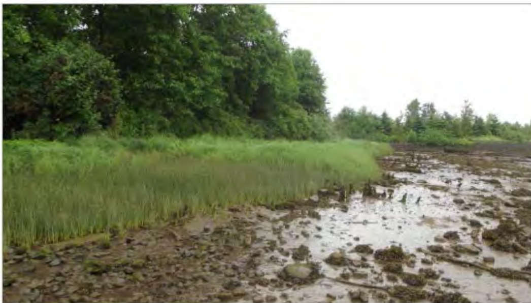
Figure 2. Restoration at Terminal 107, northwest perspective, illustrating restored conditions with established intertidal marsh and riparian vegetation in formerly un-vegetated and invasive plant area.