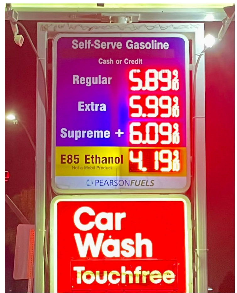
Mobil Station, San Diego, CA 4/6/20222