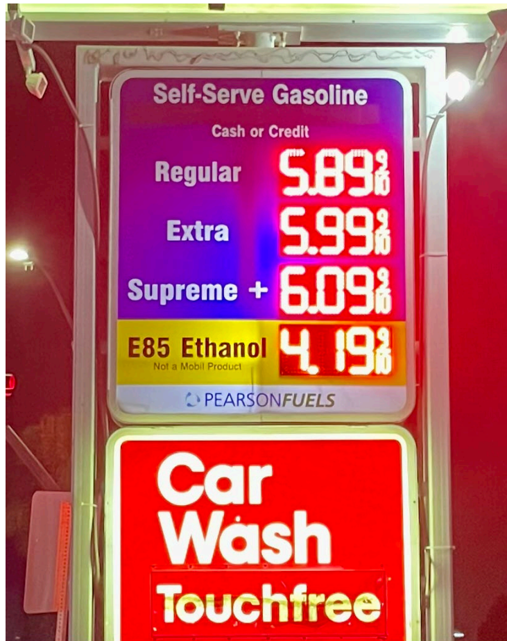
Mobil Station, San Diego, CA 4/6/2022