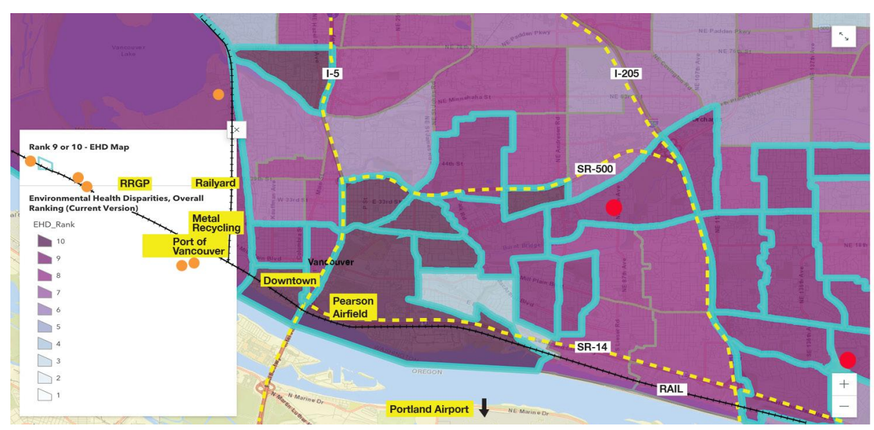
Image 1. Composite image based on the Health Disparities Map 2.0. Red dots indicate current air monitor locations. Orange dots indicate bulk fossil fuel facilities.

Much of Vancouver ranks 9 or 10 on the Health Disparities Map. Vancouver also has many neighborhoods in the 80th percentile, and a few neighborhoods in the 90th percentile, on the Environmental Justice Screen Demographic Index. We show neighborhoods in the 94th-98th percentile for Asthma Prevalence, and 92nd-94th percentile for Chronic Obstructive Pulmonary Disease. Vancouver has a substantial homeless population too. Since this Overburdened Communities program focuses on environmental justice, it makes sense for homelessness be considered as a community indicator.