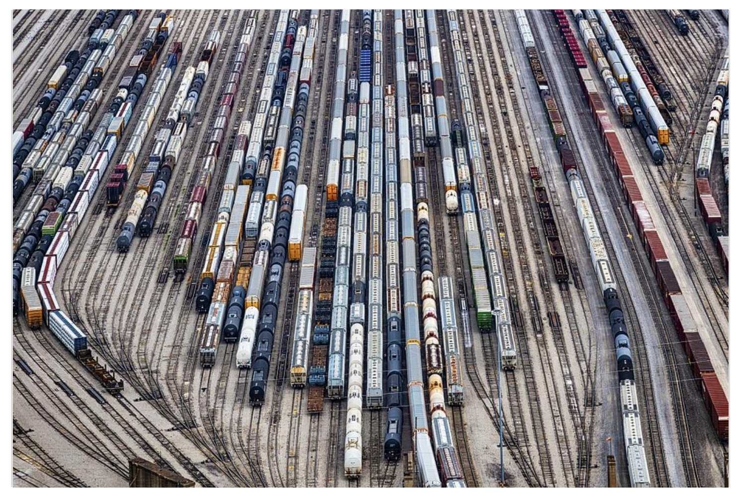
Business rail prices rose 54.7 percent from 2004 to 2016, faster than any other mode of transportation.

Productivity has leveled off, too. AAR data shows fast growth since deregulation until the mid-1990s, at which point productivity fluctuates until 2019, when productivity was about the same as it was in 1995. However, much of the railroads' productivity gains came from two sources of questionable value: laying off workers and cutting unprofitable service to smaller communities that needed railroads to reach customers. Looking at productivity figures alone masks harms to labor and left-behind places.