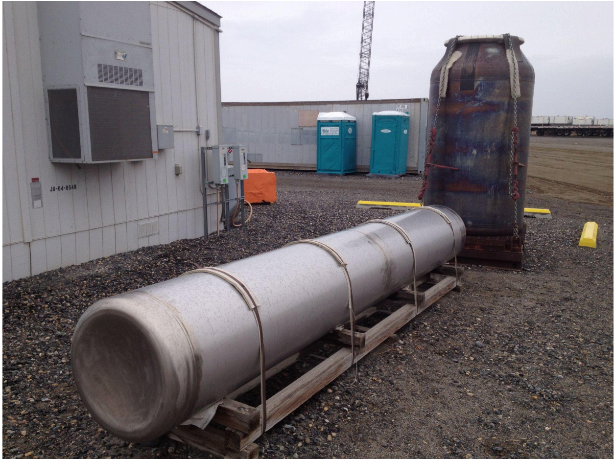
Above: The narrower canister would contain waste from the direct-feed HLW vitrification facility, and the wider canister would contain waste from the direct-feed LAW vitrification system. Photo by Columbia Riverkeeper. 2015.

This seems to deviate from the Nuclear Waste Policy Act, with consequences that were not fully addressed by the analysis offered in the TC/WM EIS.