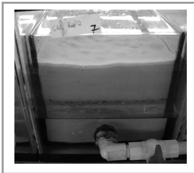
FIGURE 15 GAC TREATMENT REMAINS AT THREE INCH DEPTH INTERVAL

The GAC treatments had no vertical movement from the three inch depth layer as shown in Figure 15. There was also no observed algal growth associated with any of the GAC replicates.