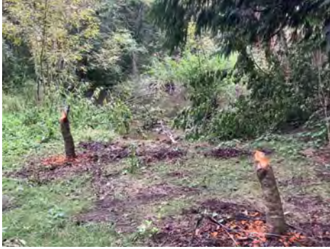
Beaver damage at pond.