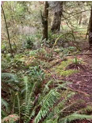
Area of strike fault.