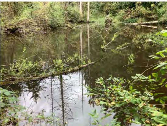
Pond on the NE corner of 28 Ave & Cooper Point Road NW.