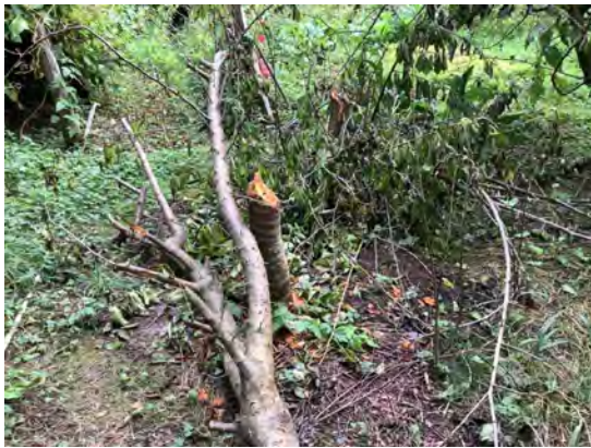
More beaver damage.