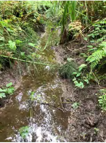
Heading further east from pond.