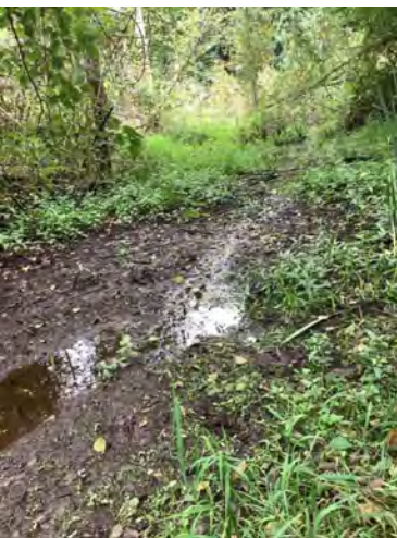
Channel leading east from pond.