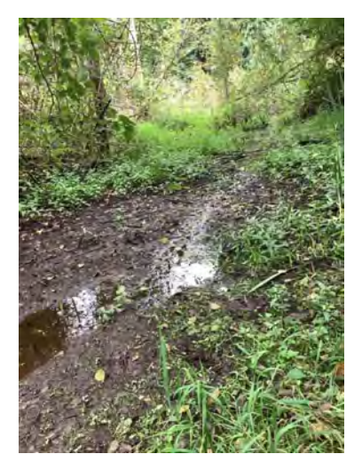
Channel leading east from pond.