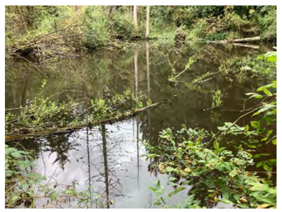
Pond on the NE corner of 28 Ave & Cooper Point Road NW.