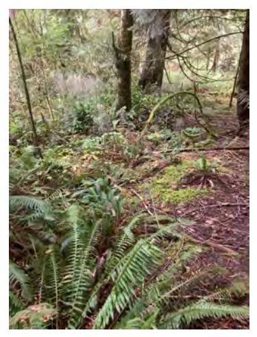
Area of strike fault.