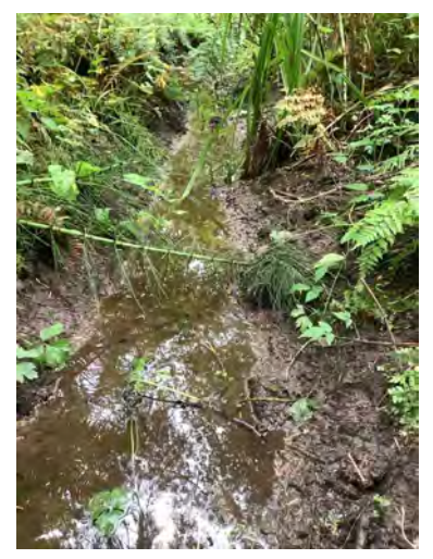
Heading further east from pond.