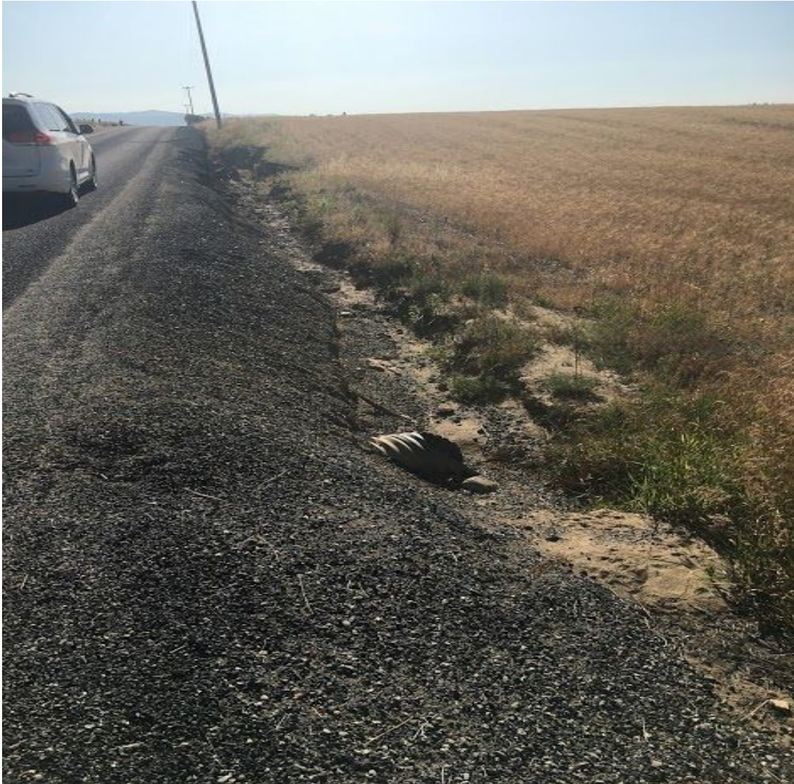
Roadside shoulder in the LSR Basin - Spokane County

SRK recommends mandating the aggressive phase-out of stormwater conveyances, and outfalls to the tributaries and the LSR. Specifically, bullet #5 on this page should have concrete and specific, prescriptive actions and BMPs - such as Low Impact Development - that are listed out and described. These should include benchmarks and timetables that are agreed to between WDOE, WSDOT, and Spokane County to bring the MS4 outfalls and simple roadside ditches into compliance with TMDL planning and water quality attainment.