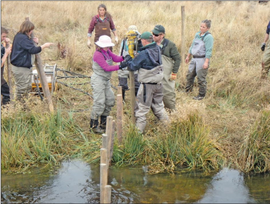
Eco Logical Research, Inc.