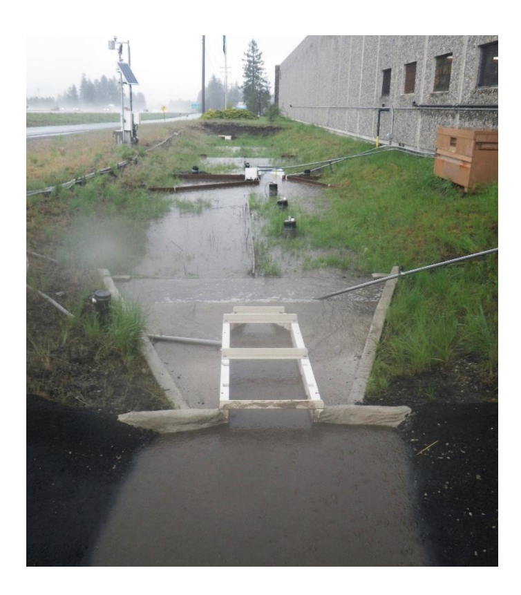
Figure 4. Example of a compost-amended biofiltration swale. Stormwater is filtered as it flows along the grass in the swale and infiltrates into the topsoil and compost.

Factors used to identify these areas include, but are not limited to, level of traffic, impervious surfaces, precipitation, media composition that stormwater travels through to get to receiving water, size of the receiving water, and the presence of sensitive species.