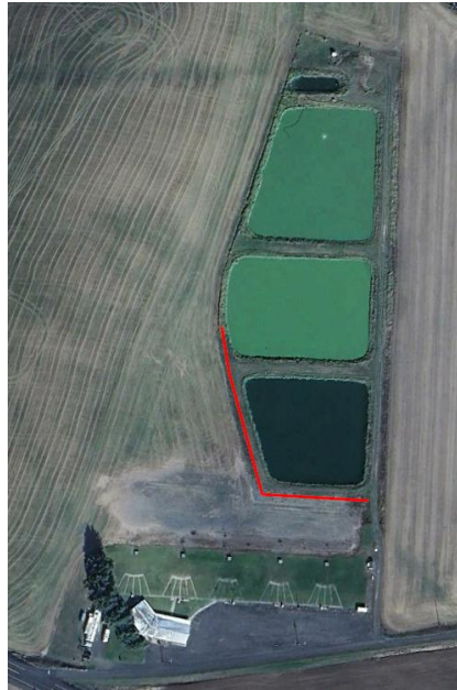
FIGURE 3.1 - SHOT FENCE IMPROVEMENTS LOCATION

The shot fence improvements described above would be located in the approximate location shown in Figure 3.1 below in red.