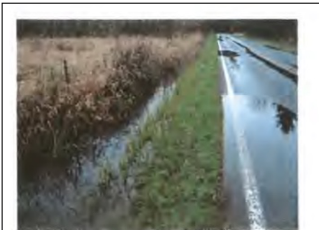
Figure 8. Not aesthetic due to road. Roads built in marshes lower habitat suitability for wildlife and also are not aesthetic because people see the water on roadway. Perhaps avoid building a road x these places?