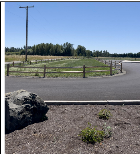
Figure 3. Viewing platform of ESA listed habitat.