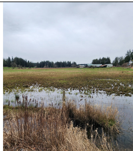
Figure 4. ESA listed wetland Habitat south of Olympia