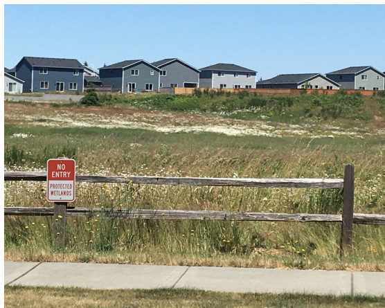
Figure 5. This was not aesthetic to downstreamers. Compare with view in Figure 4.