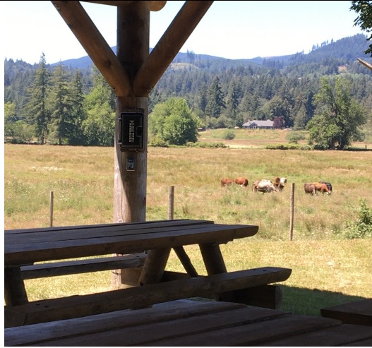
Figure 3. View of ESA listed species habitat from Port Blakely location