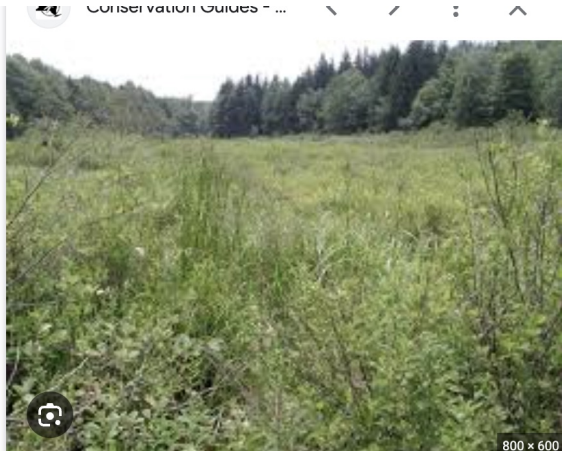
Figure 4, View of ESA habitat south of Olympia. Watershed natural