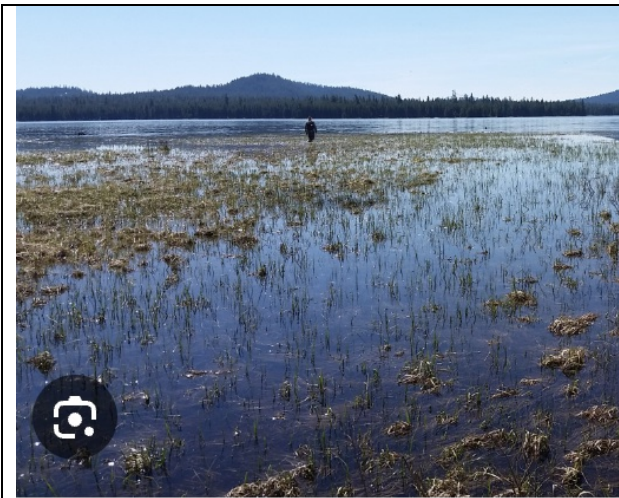
Figure 1. Wildlife habitat near Trout Lake Washington.

21) Consider aesthetics more fully or set real criteria. There is little discussion of aesthetics of natural conditions of wildlife habitats in and near surface waters. Changes to natural conditions affect both wildlife habitat, aquatic habitat and the design of stormwater management systems. Yes aesthetics is sometimes a natural condition and sometimes environmental baseline condition and changed by human activities. We all say we like wildlife habitat but we appreciate the views and the smells and the sounds. We don't like to see or hear deleterious materials like invasive species in wildlife habitat. As an example, One goal of habitat management for Oregon spotted frogs is to maintain meadow like conditions to maintain breeding habitat. Another goal of habitat management is to ameliorate the hydrological fluctuations that impair breeding success. One way to do that is to retain forest in head waters above their designated critical habitats. People also prefer to see forests rather than impervious surfaces above their farmlands that host endangered wildlife.