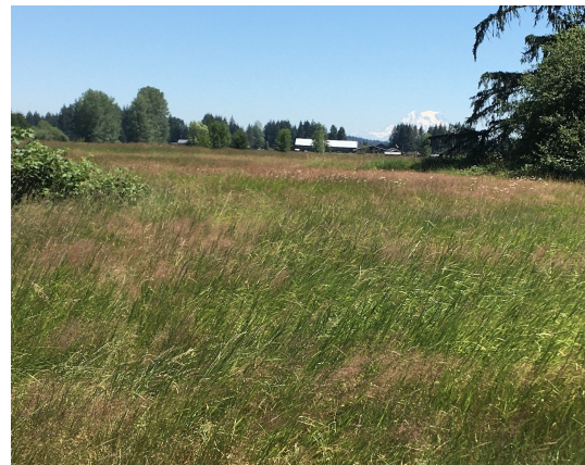
Figure 2. ESA habitat South of Olympia