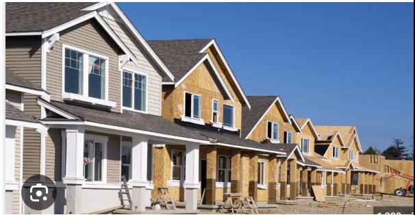
Figure. These views are of homes but some find them not aesthetic.