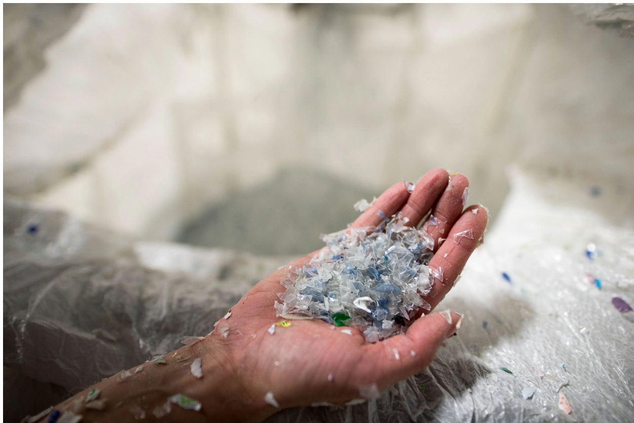
Recycled product is displayed at a recycling facility in Ontario, Canada.

Koldewey’s own campaign to reduce the use of bottled water in London, called #OneLess, studied possible locations for placing refilling kiosks that would get the most use, such as public transportation hubs. The group also conducted surveys that found most residents would prefer to get water from the tap but were uncomfortable asking stores or restaurants for a free refill. The initiative to sign up businesses that would allow people to refill their bottles was aimed at overcoming that reluctance. Addressing such potential barriers is crucial to changing people’s habits, Koldewey says.