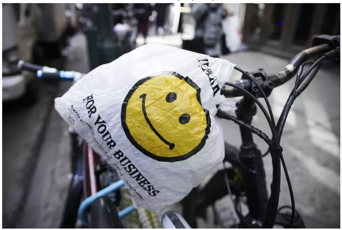
The petrochemical industry has lobbied the federal government to declare an official preference for single-use plastic bags.