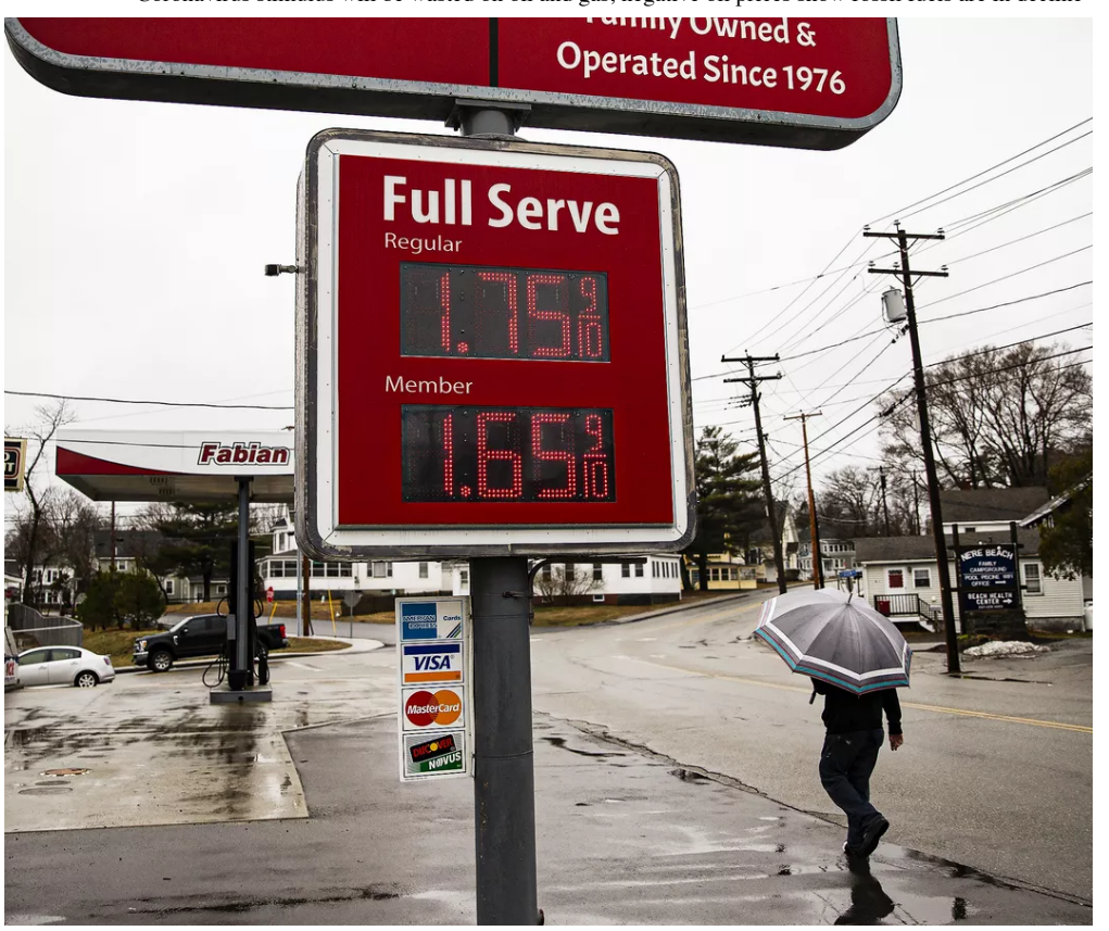
Low gas prices in Old Orchard Beach, Maine, on March 30.