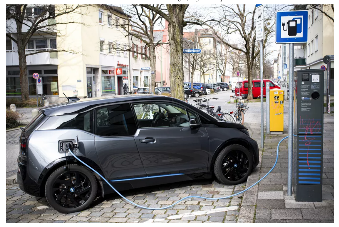
An electric car at a charging station in Bavaria, Germany, on March 26, 2020.

Fourth, oil and gas majors are revealing their own weakness by writing down assets — effectively conceding that certain reserves cannot be profitably exploited. In 2019, Chevron wrote down $11 billion worth; Spanish oil company Repsol recently wrote down $5 billion worth. Exxon Mobil, after adding Canadian tar sands assets to its books in 2017, reversed course and wrote down 3.2 billion barrels last year.