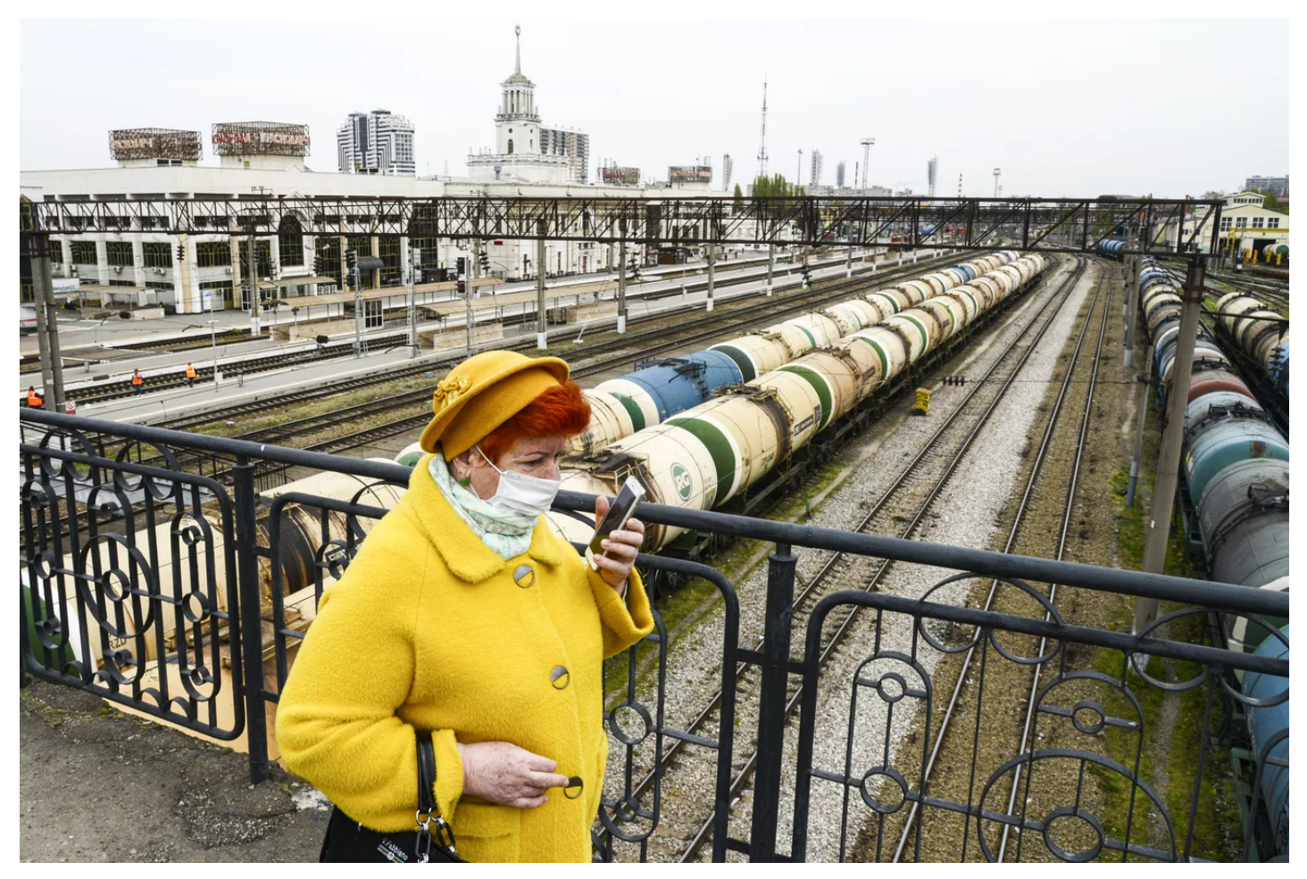
Freight trains filled with oil in Krasnodar, Russia, on April 14. As supply exceeds demand and oil prices fall, oil producers find themselves confronted with storage challenges.

(In the hours after this article was first published on April 20, oil futures for May fell to negative prices . Mind-boggling.)