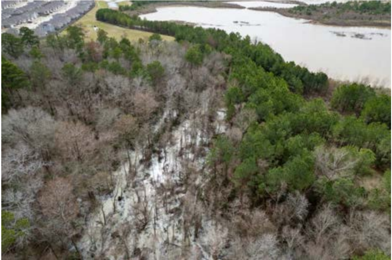
Effluent from the Hallett settling pond on San Jacinto West Fork escaping into adjacent property owned by others.