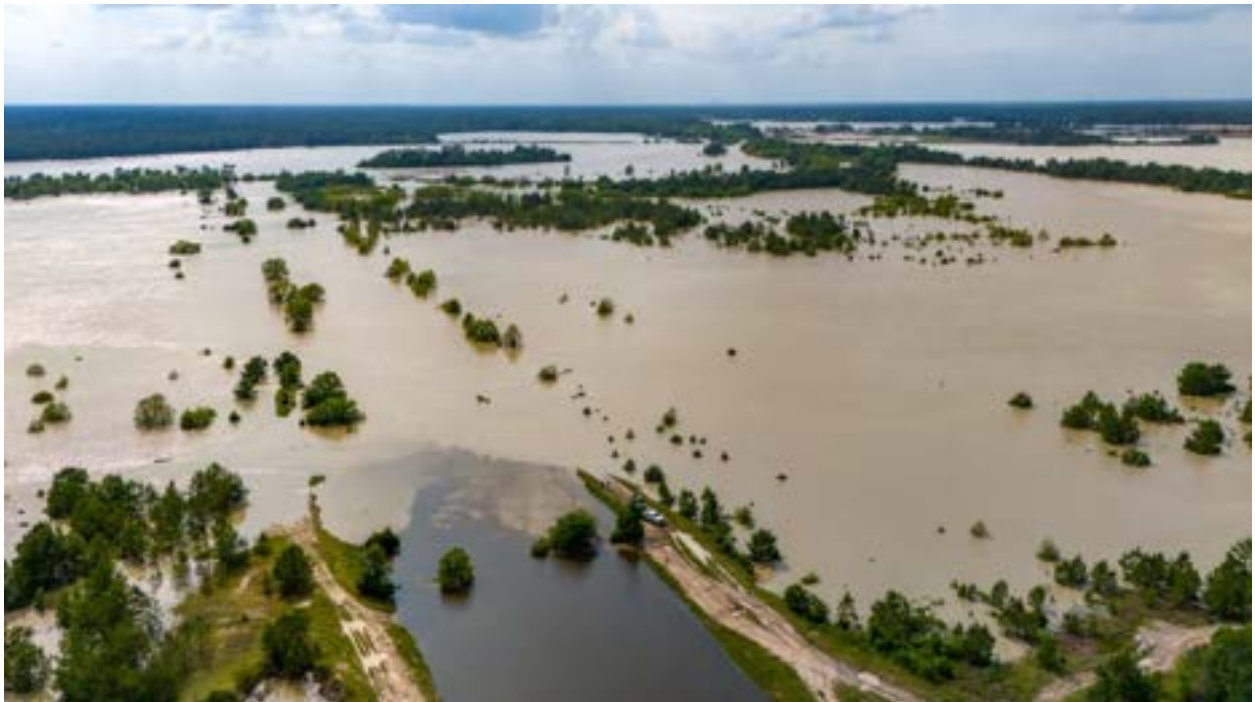
Effluent from the Hallett Mine (upstream in upper right) polluting the West Fork at the Northpark/Oakhurst Ditch (middle foreground). Water flows right to left. Facing West.