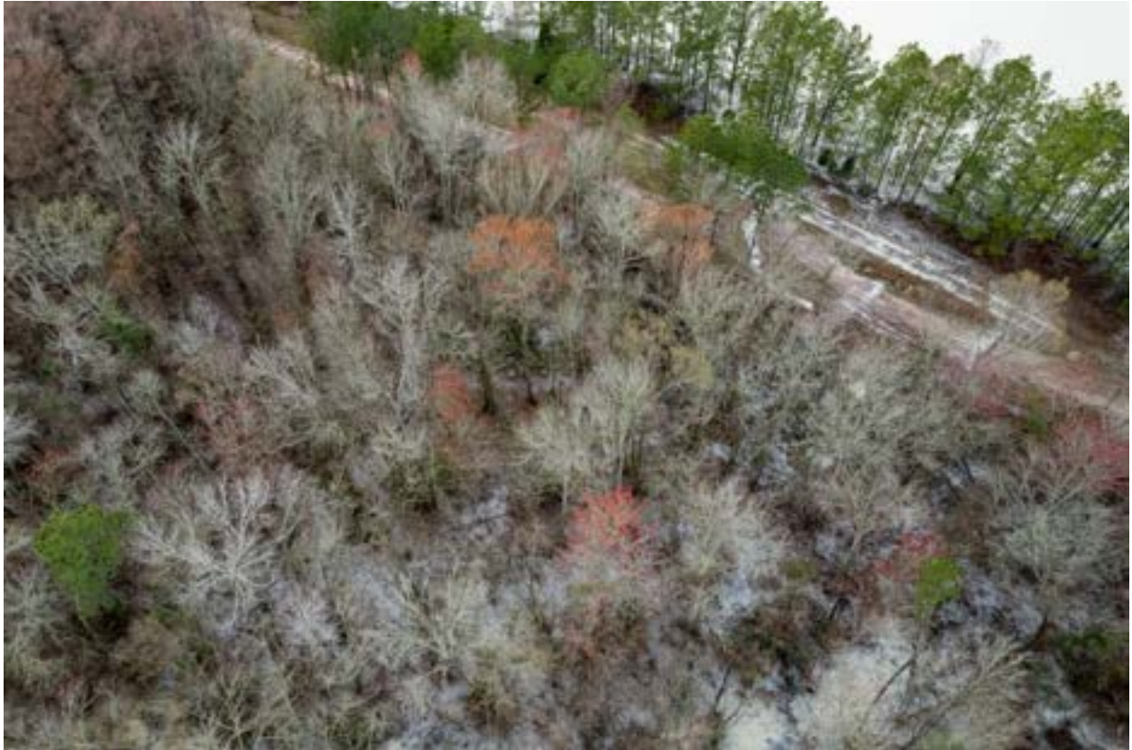
Close up of same effluent from same pond shows source of leakage.