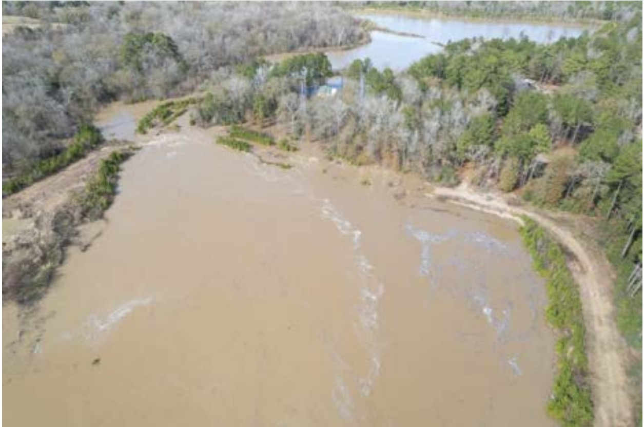
San Jacinto East Fork capturing a mine in Plum Grove.