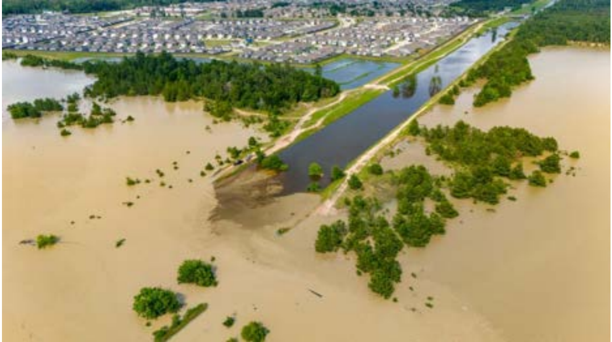
Reverse angle (facing east) shows proximity of pollution to homes in Northpark Woods subdivision. That's the Oakhurst Ditch, which empties into the West Fork behind camera position. Water flows left to right. Hallett mine is upstream on left.