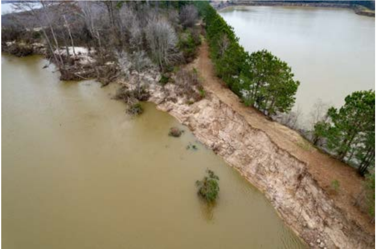
Dike of abandoned Williams Brothers Mine (upper right) eroded by the San Jacinto West Fork (lower left).