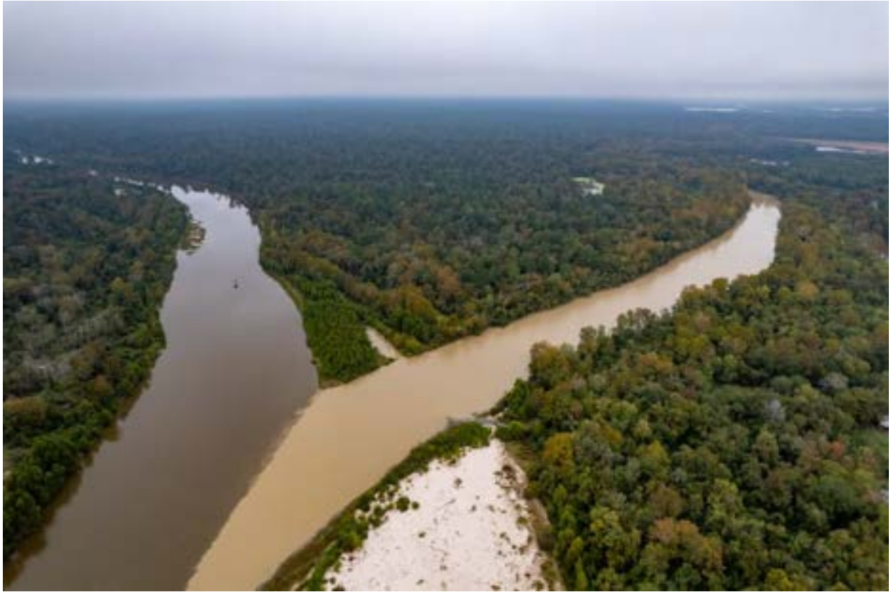
Confluence of San Jacinto West Fork (right) and Spring Creek near US59 Bridge. This is a frequent sight. Twenty square miles of mines are upstream on the right in a 20-mile reach of the river.