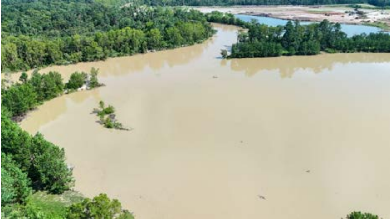
... Hurricane Beryl eroded what was left of the wall and flowed through the pit.