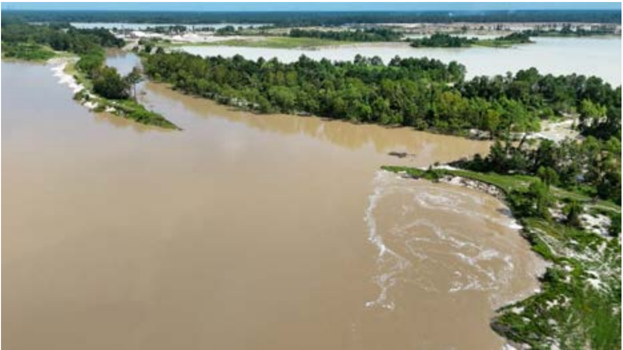
The West Fork now flows into the pit at the north end...