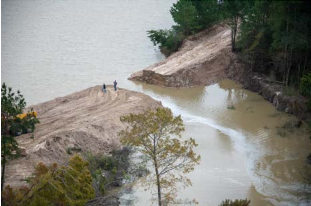
Broken dike at the Triple PG sand mine in Porter. Industrial wastewater is flowing out of the mine into White Oak Creek which joins Caney Creek and the San Jacinto East Fork before flowing into Lake Houston.

These pictures demonstrate that flooding of sand mines is a huge environmental problem in the Lake Houston Area. We have industrial waste increasing flood risk and polluting the drinking water supply for 2 million people. And the TCEQ BMPs don't even address the problem.