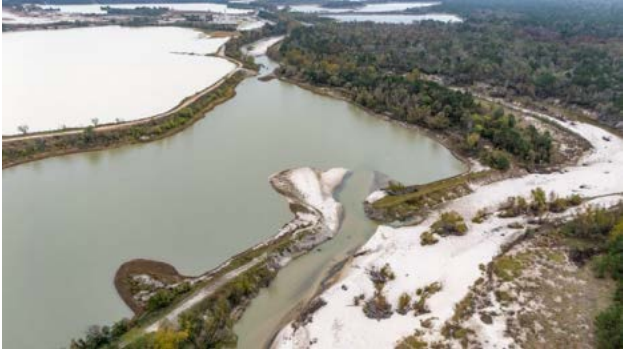
Another West Fork pit capture at the Hallett Mine after floodwaters receded. Notice how natural channel of the river has been virtually cut off.