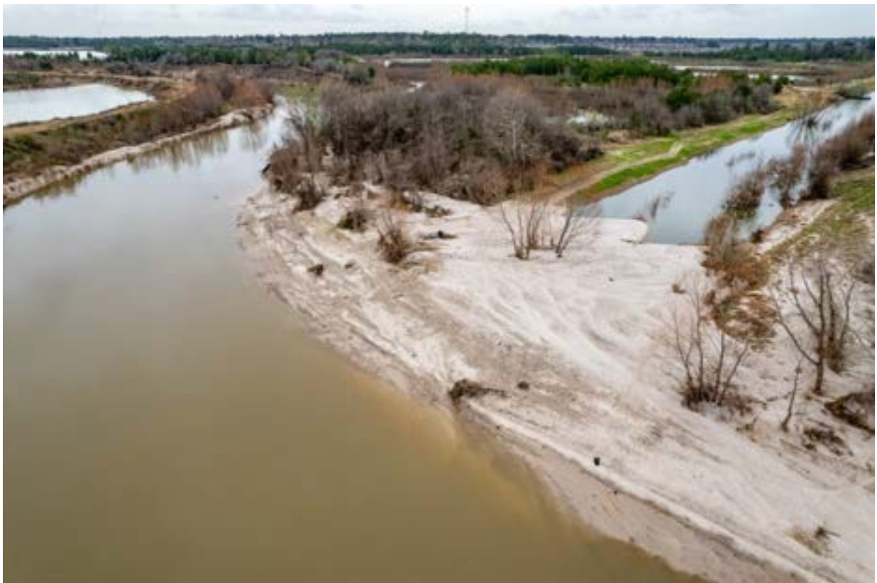
Same ditch blocked by sand increases flood risk for homes (visible in top right).