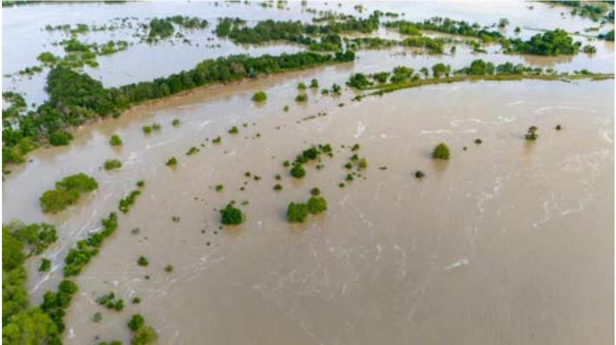
A drone followed logs floating through this captured West Fork pit at 5 MPH.

Miners claim their pits actually capture sand and keep it from floating downstream. That may be true at certain times during a flood, for instance, as it recedes. However, at the peak of the May 2024 flood, the speed of floodwater was sufficient to entrain sand in pits and carry it downstream.