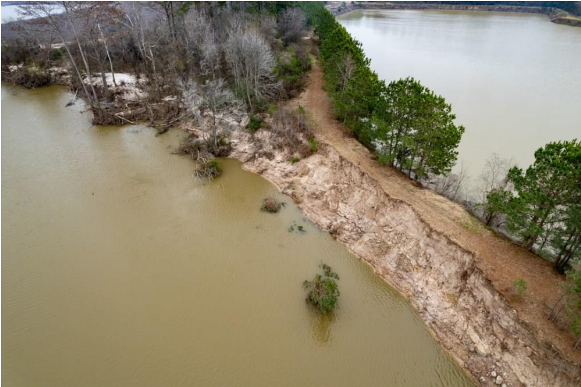
Dike of abandoned Williams Brothers Mine (upper right) eroded by the San Jacinto West Fork (lower left).