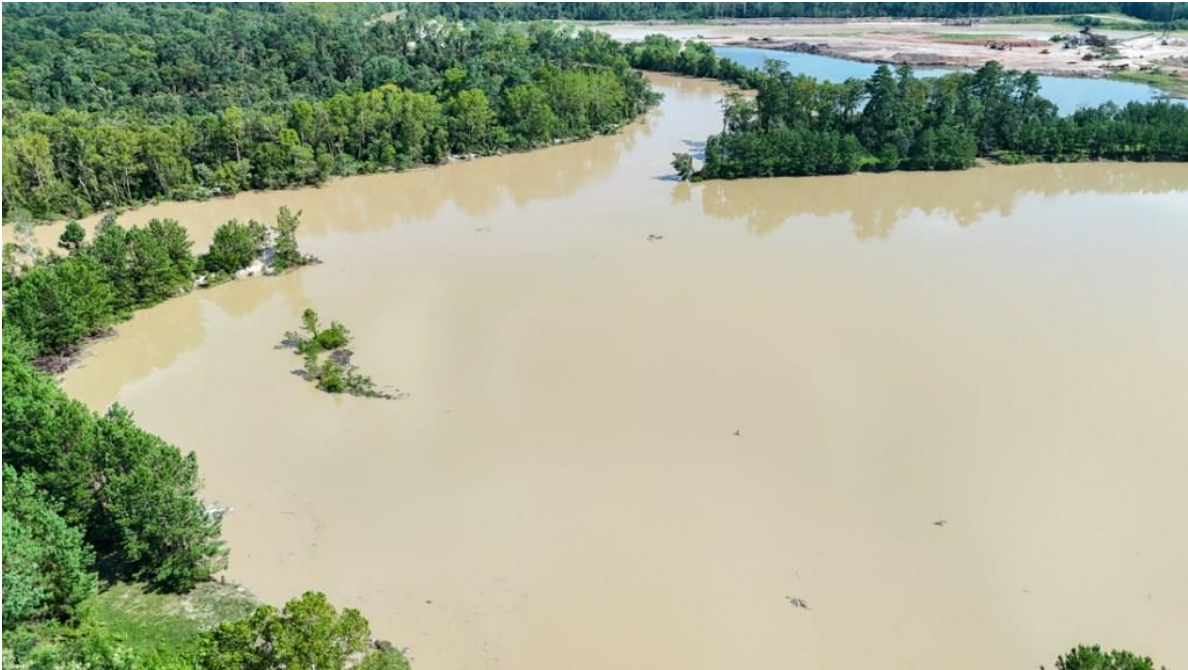
... Hurricane Beryl eroded what was left of the wall and flowed through the pit.

A little upstream, Hallett sold a sand pit (below left) on the San Jacinto West Fork to a real estate developer, Riverwalk Porter LLC. Within months, the river captured the pit.