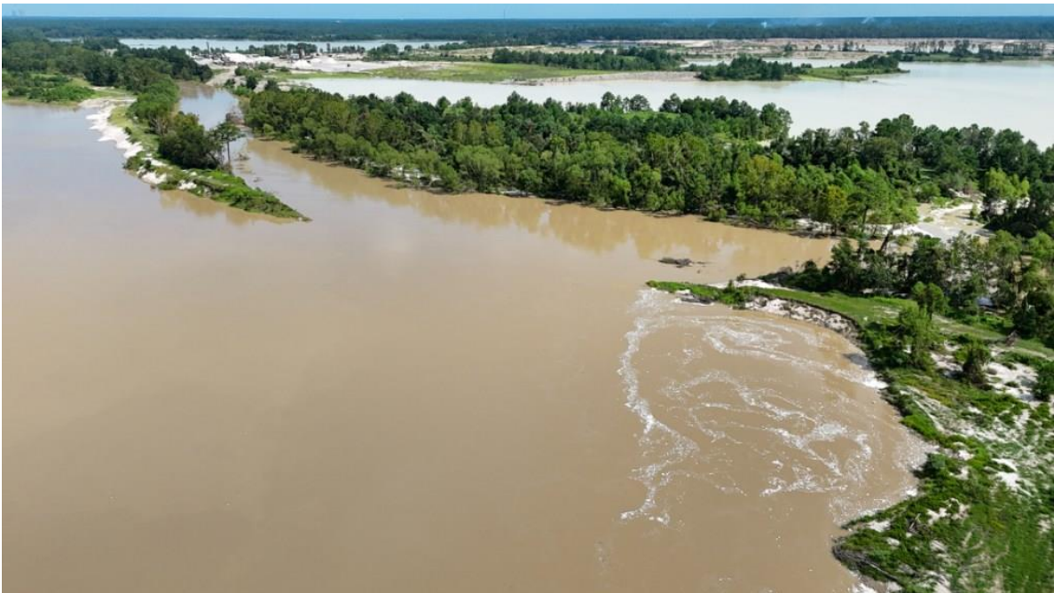
The West Fork now flows into the pit at the north end...