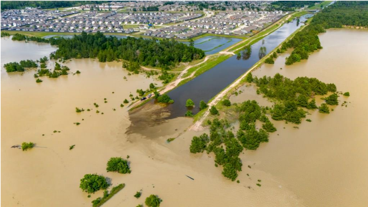
Reverse angle (facing east) shows proximity of pollution to homes in Northpark Woods subdivision. That's the Oakhurst Ditch, which empties into the West Fork behind camera position. Water flows left to right. Hallett mine is upstream on left.