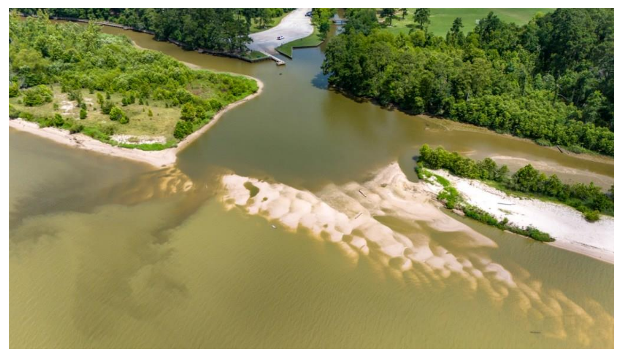
Farther downstream, the Kingwood Diversion Ditch (top middle) also became blocked by sediment. A Harris County Flood Control District study found that the <u>Diversion Ditch was one of the two most dangerous flooding problems</u> in Kingwood.

The entrance to this ditch had just recently been dredged by the Army Corps.