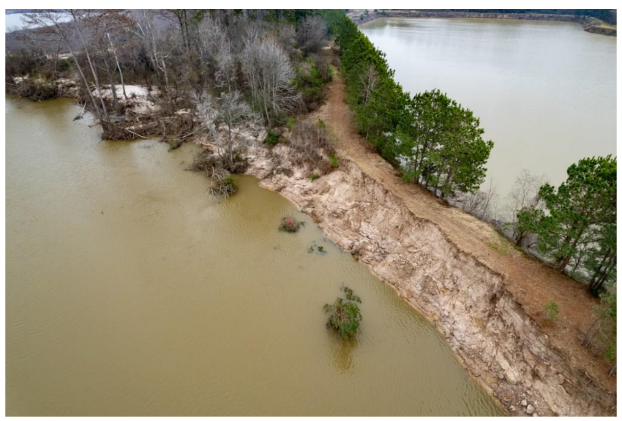
Dike of abandoned Williams Brothers Mine (upper right) eroded by the San Jacinto West Fork (lower left).