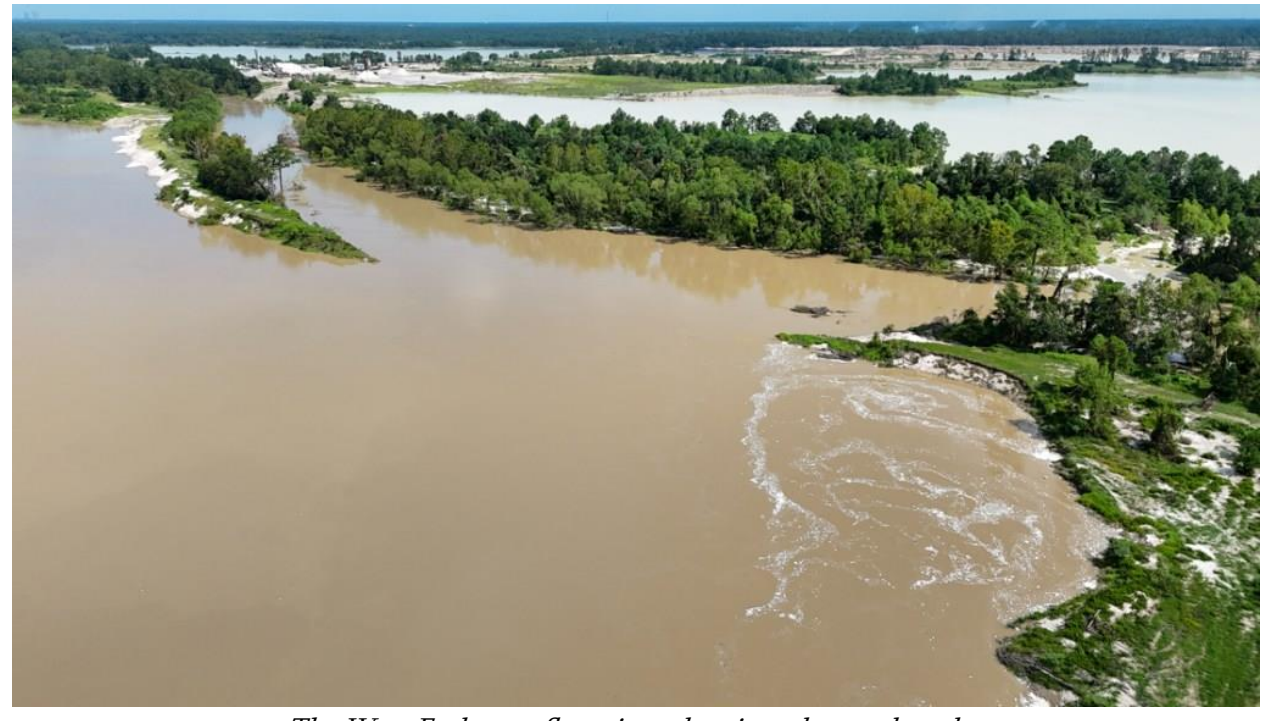
The West Fork now flows into the pit at the north end...