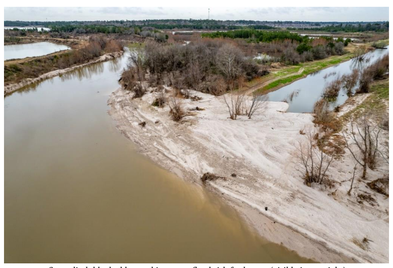
Same ditch blocked by sand increases flood risk for homes (visible in top right).