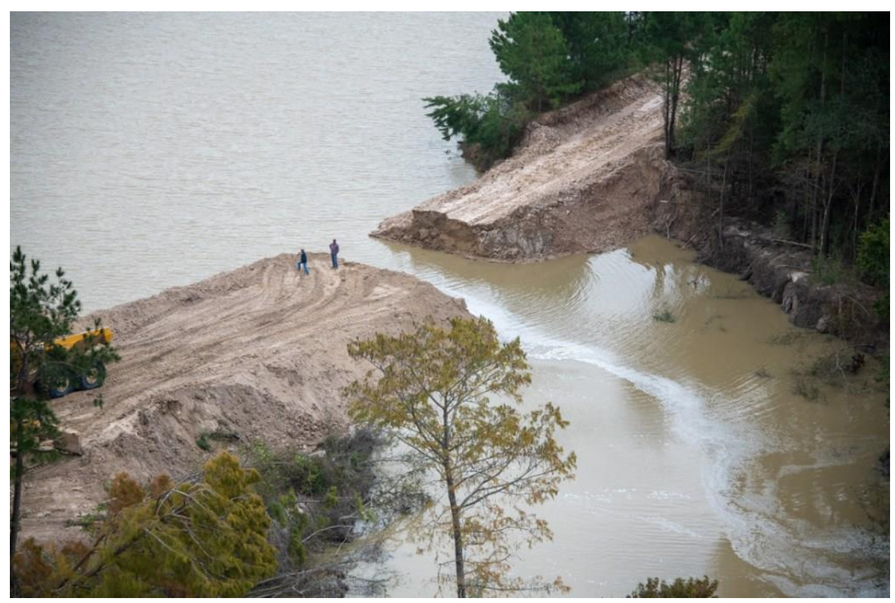
Broken dike at the Triple PG sand mine in Porter. Industrial wastewater is flowing out of the mine into White Oak Creek which joins Caney Creek and the San Jacinto East Fork before flowing into Lake Houston.

These pictures demonstrate that flooding of sand mines is a huge environmental problem in the Lake Houston Area. We have industrial waste increasing flood risk and polluting the drinking water supply for 2 million people. And the TCEQ BMPs don't even address the problem.