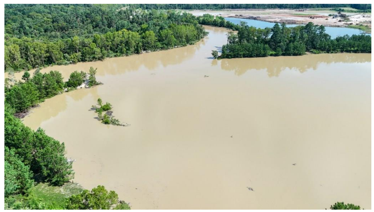
... Hurricane Beryl eroded what was left of the wall and flowed through the pit.