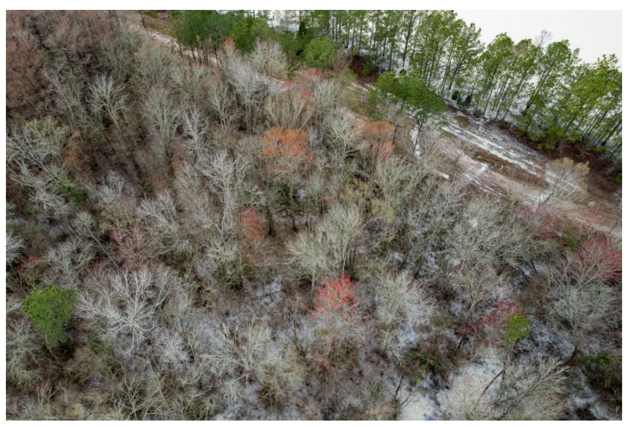
Close up of same effluent from same pond shows source of leakage.