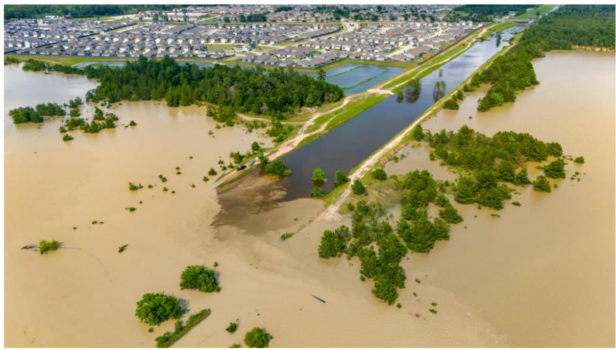
Reverse angle (facing east) shows proximity of pollution to homes in Northpark Woods subdivision. That's the Oakhurst Ditch, which empties into the West Fork behind camera position. Water flows left to right. Hallett mine is upstream on left.