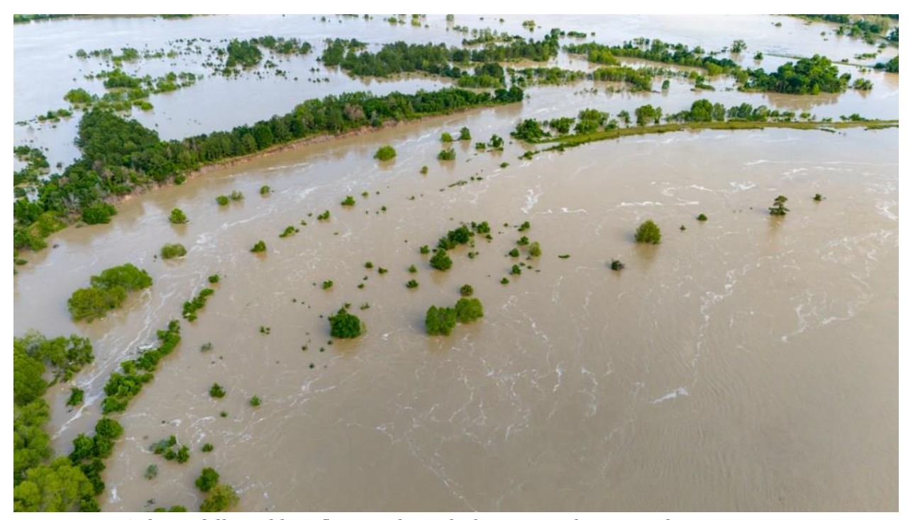
A drone followed logs floating through this captured West Fork pit at 5 MPH.

Miners claim their pits actually capture sand and keep it from floating downstream. That may be true at certain times during a flood, for instance, as it recedes. However, at the peak of the May 2024 flood, the speed of floodwater was sufficient to entrain sand in pits and carry it downstream.