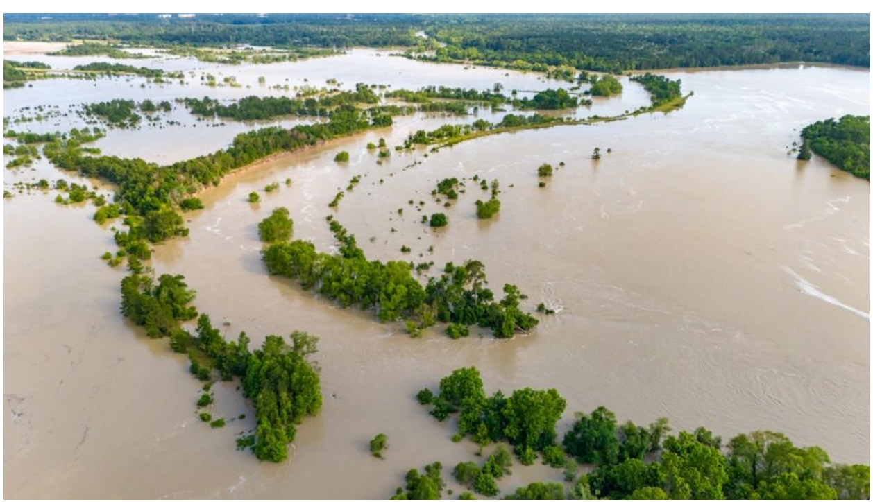
Wider shot of same pit (to the right of the S-turn) shows both the entry breach (lower right) and exit breach (upper right) in the dikes.