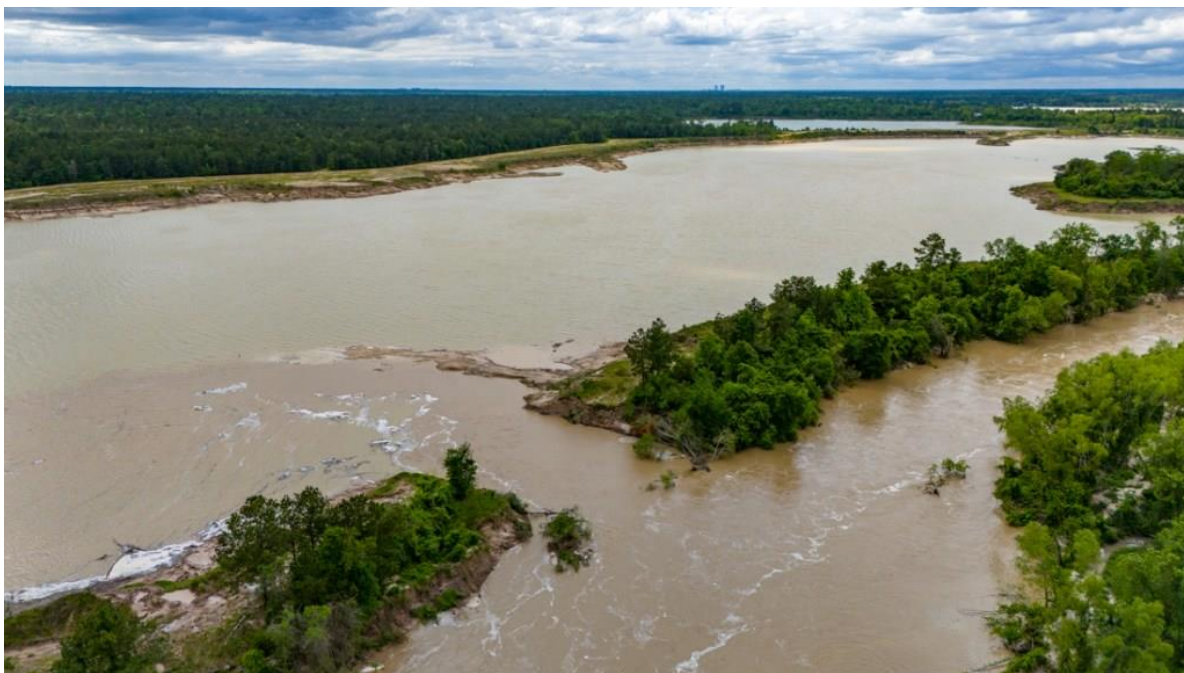
...and flows out at the south end.