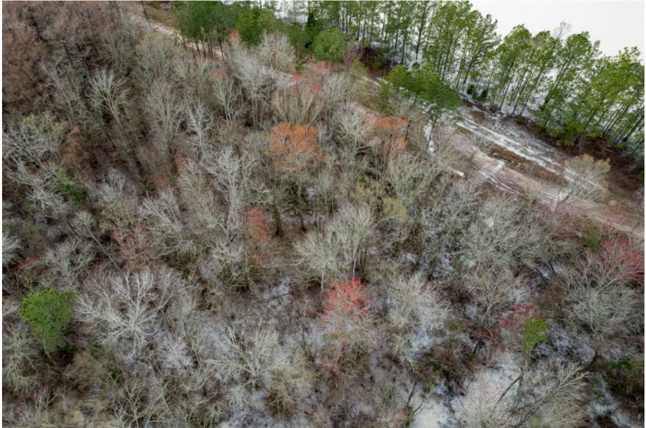
Close up of same effluent from same pond shows source of leakage.