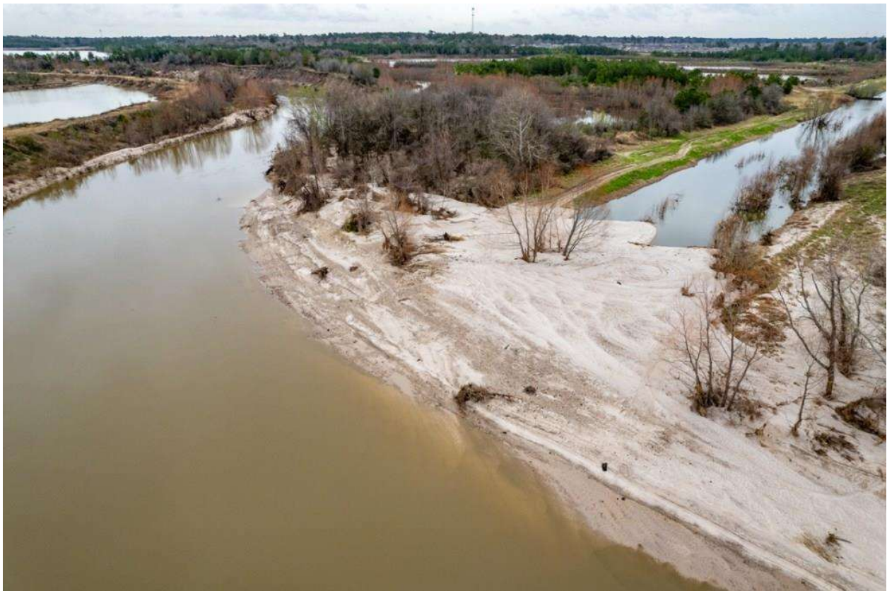
Same ditch blocked by sand increases flood risk for homes (visible in top right).