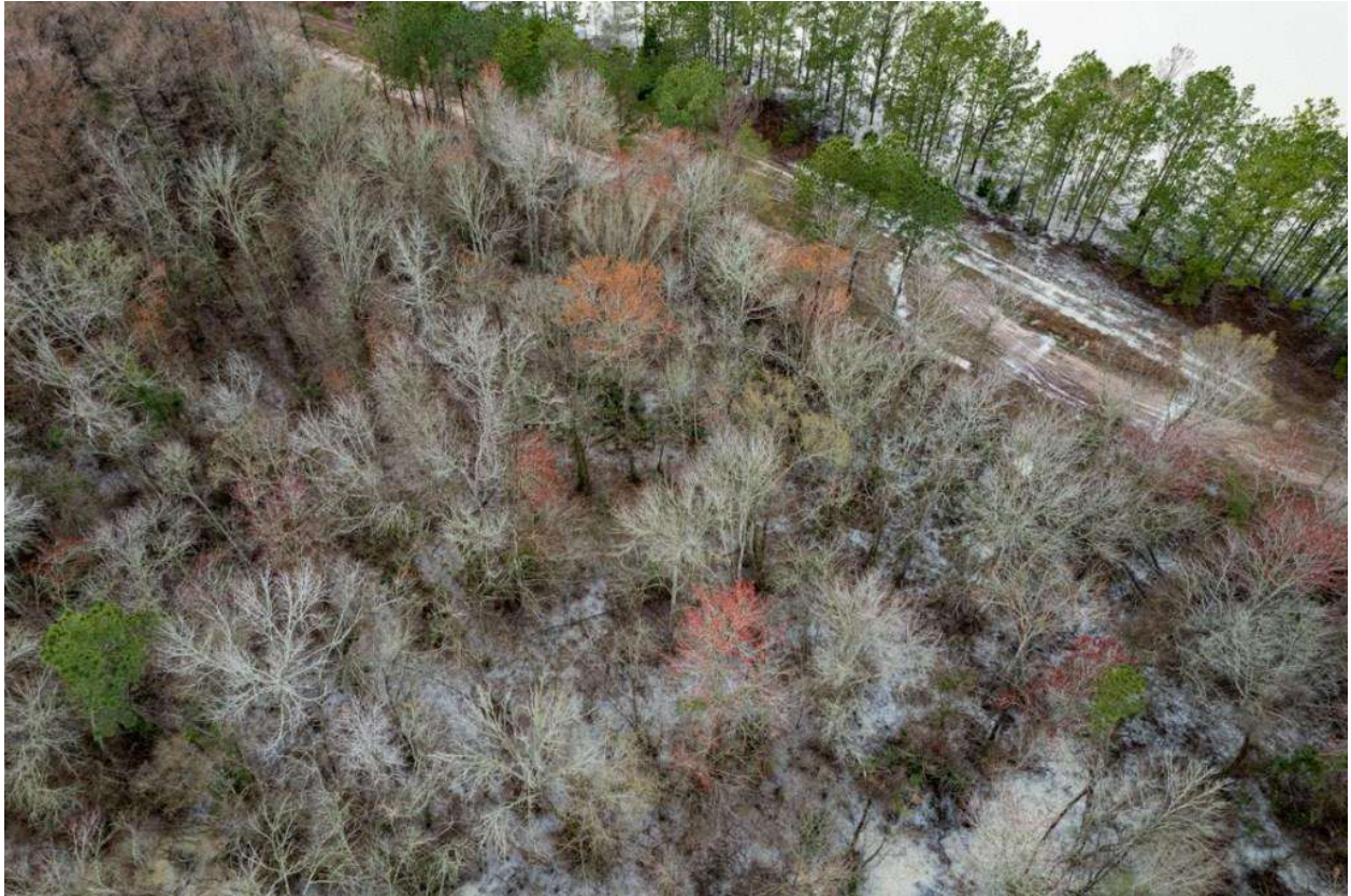
Close up of same effluent from same pond shows source of leakage.