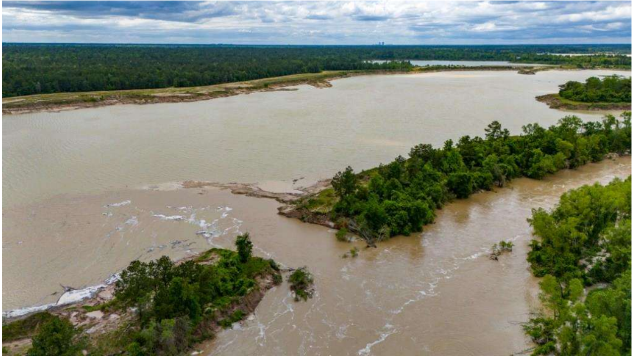
...and flows out at the south end.