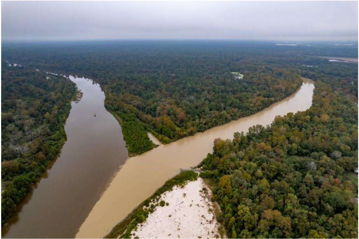
Confluence of San Jacinto West Fork (right) and Spring Creek near US59 Bridge. This is a frequent sight. Twenty square miles of mines are upstream on the right in a 20-mile reach of the river.