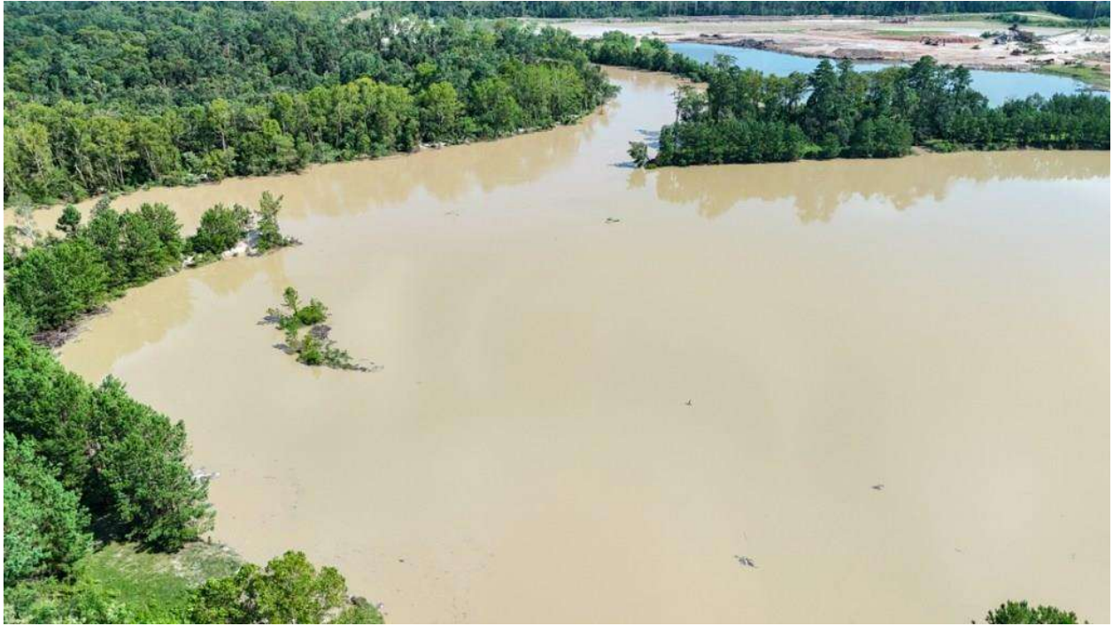
... Hurricane Beryl eroded what was left of the wall and flowed through the pit.