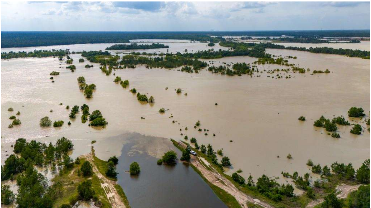
Effluent from the Hallett Mine (upstream in upper right) polluting the West Fork at the Northpark/Oakhurst Ditch (middle foreground). Water flows right to left. Facing West.