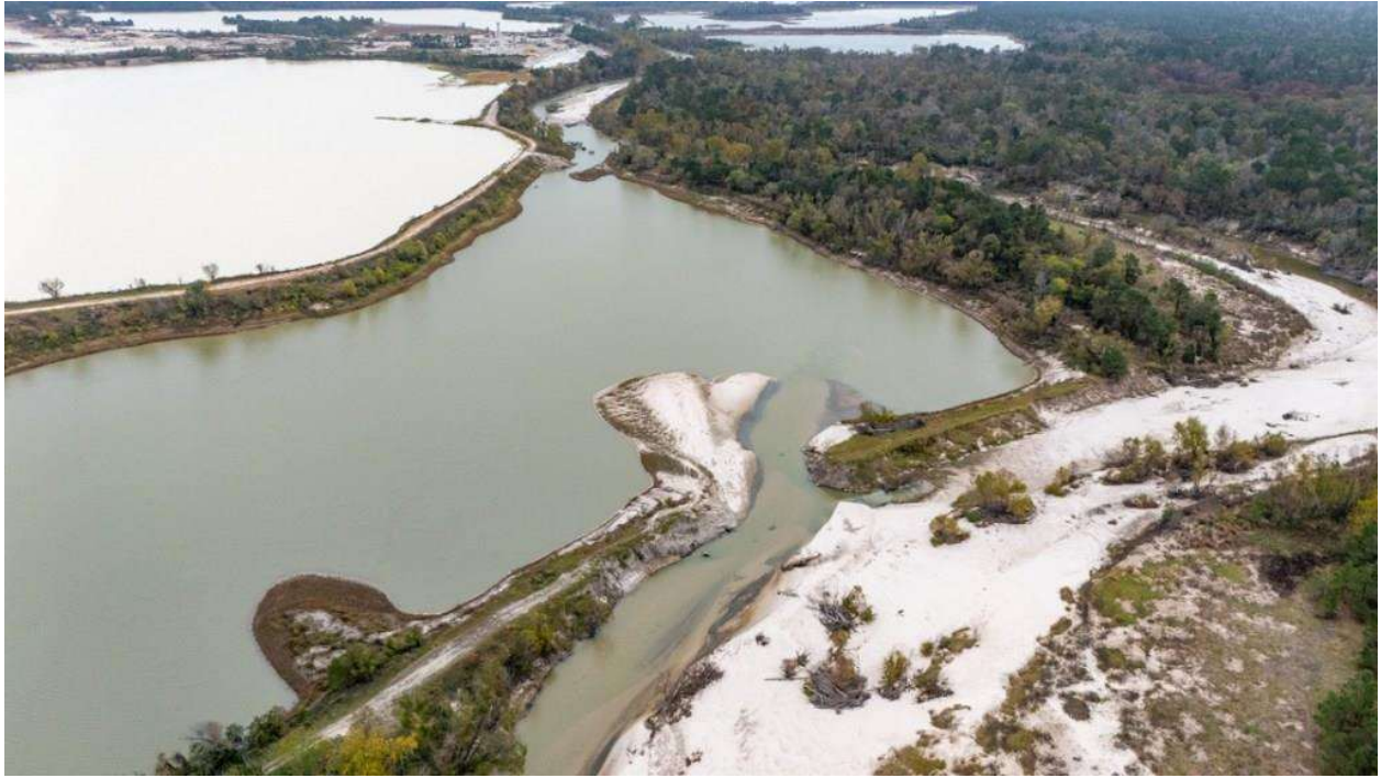
Another West Fork pit capture at the Hallett Mine after floodwaters receded. Notice how natural channel of the river has been virtually cut off.