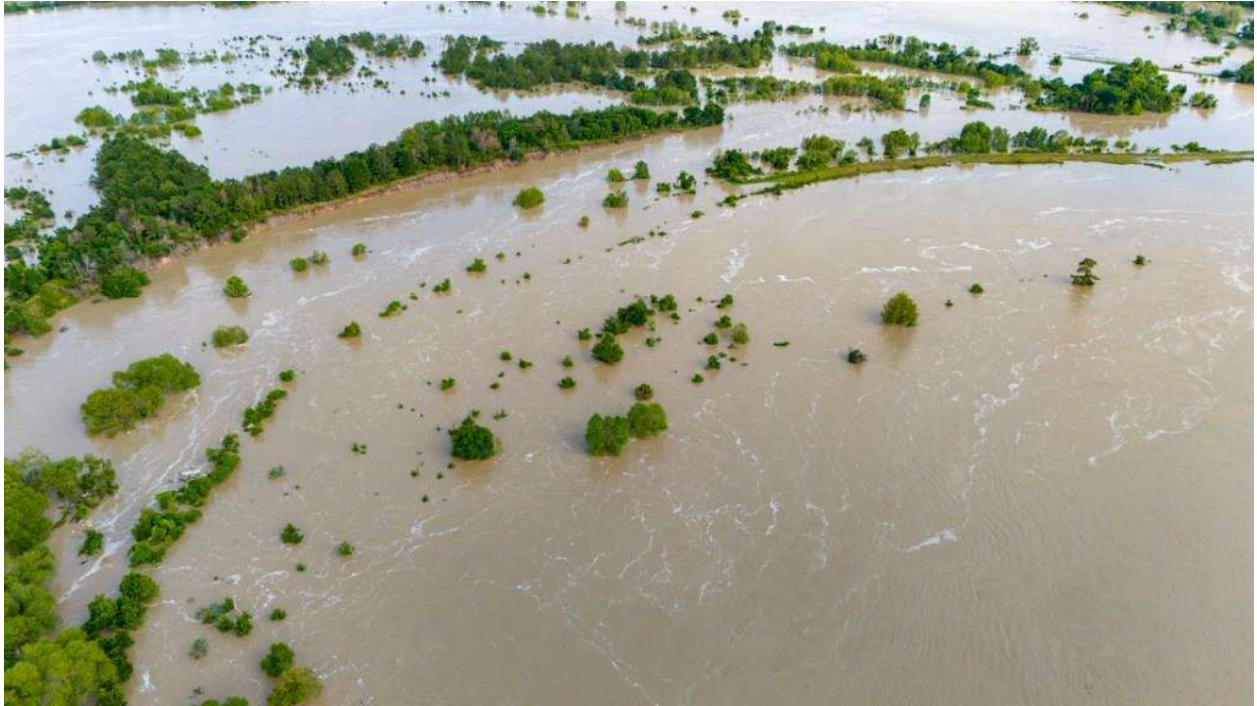
A drone followed logs floating through this captured West Fork pit at 5 MPH.

Miners claim their pits actually capture sand and keep it from floating downstream. That may be true at certain times during a flood, for instance, as it recedes. However, at the peak of the May 2024 flood, the speed of floodwater was sufficient to entrain sand in pits and carry it downstream.