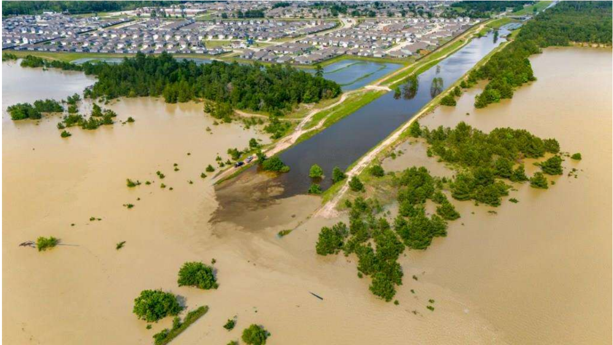
Reverse angle (facing east) shows proximity of pollution to homes in Northpark Woods subdivision. That's the Oakhurst Ditch, which empties into the West Fork behind camera position. Water flows left to right. Hallett mine is upstream on left.