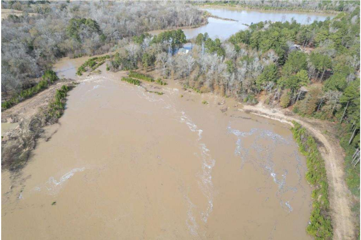
San Jacinto East Fork capturing a mine in Plum Grove.