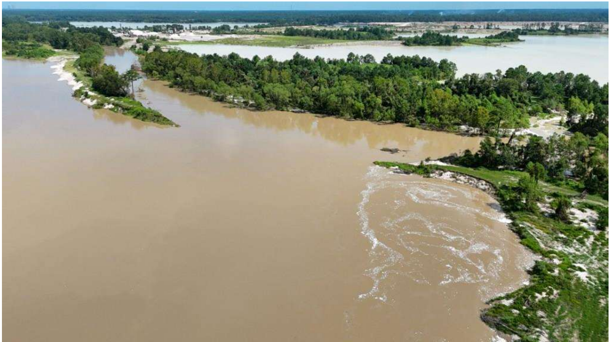
The West Fork now flows into the pit at the north end...