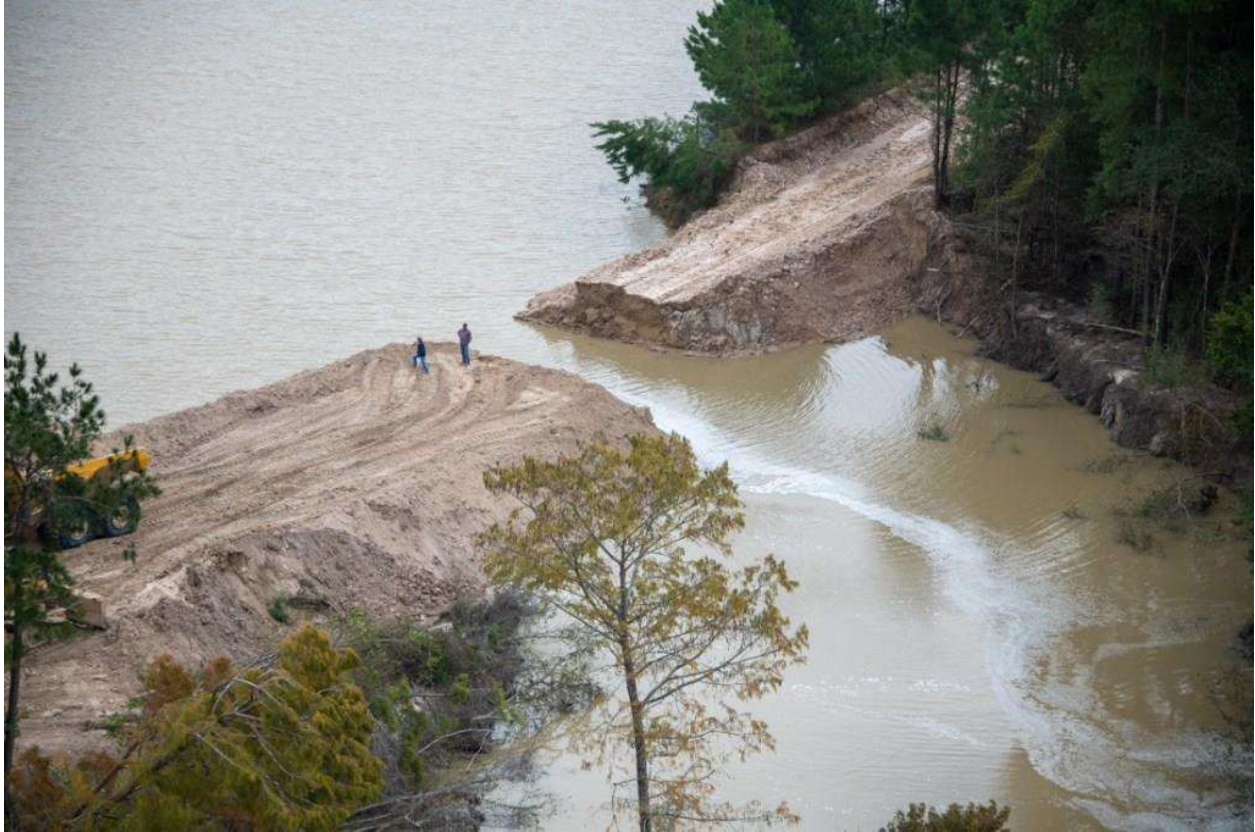
Broken dike at the Triple PG sand mine in Porter. Industrial wastewater is flowing out of the mine into White Oak Creek which joins Caney Creek and the San Jacinto East Fork before flowing into Lake Houston.

These pictures demonstrate that flooding of sand mines is a huge environmental problem in the Lake Houston Area. We have industrial waste increasing flood risk and polluting the drinking water supply for 2 million people. And the TCEQ BMPs don't even address the problem.