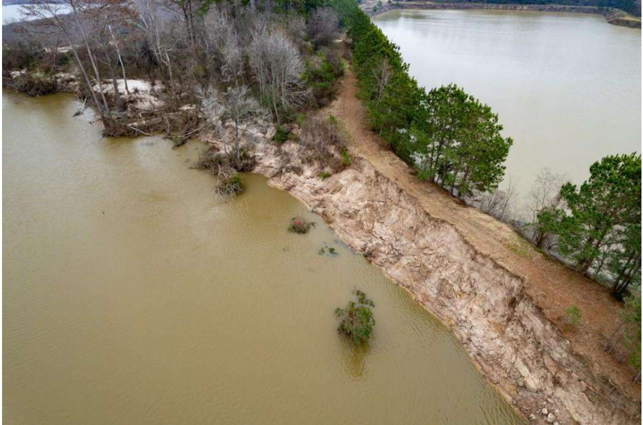
Dike of abandoned Williams Brothers Mine (upper right) eroded by the San Jacinto West Fork (lower left).