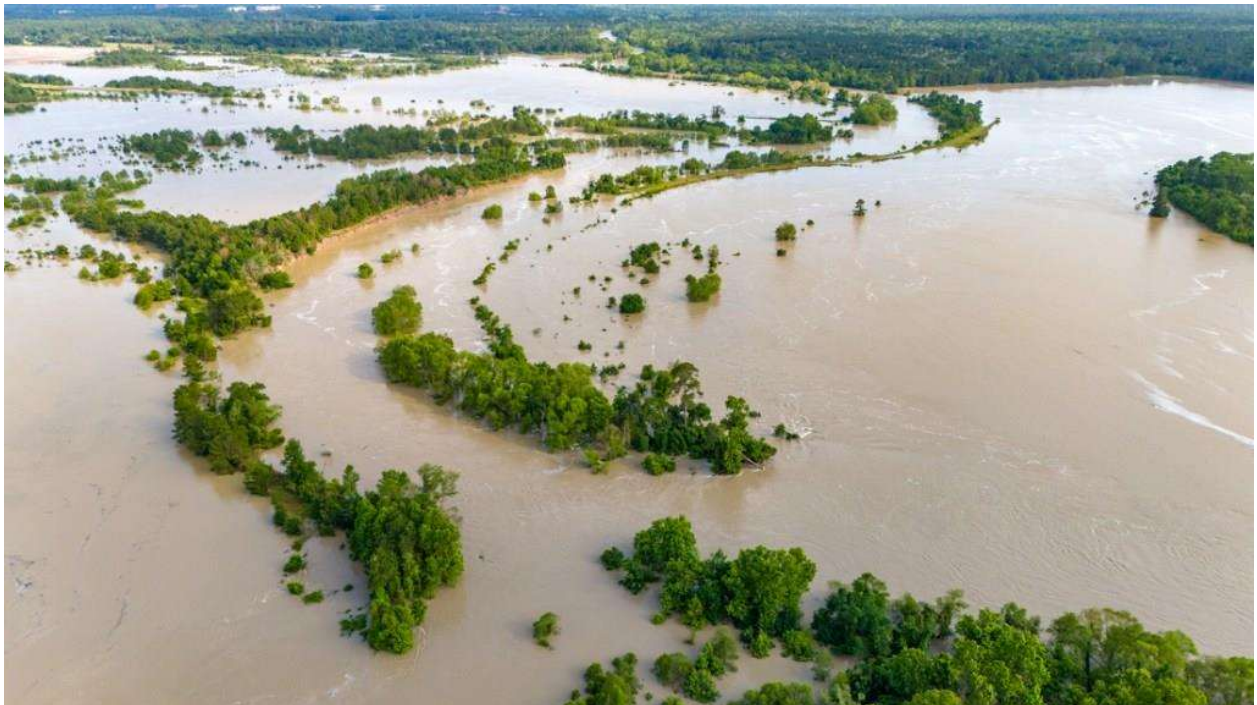
Wider shot of same pit (to the right of the S-turn) shows both the entry breach (lower right) and exit breach (upper right) in the dikes.