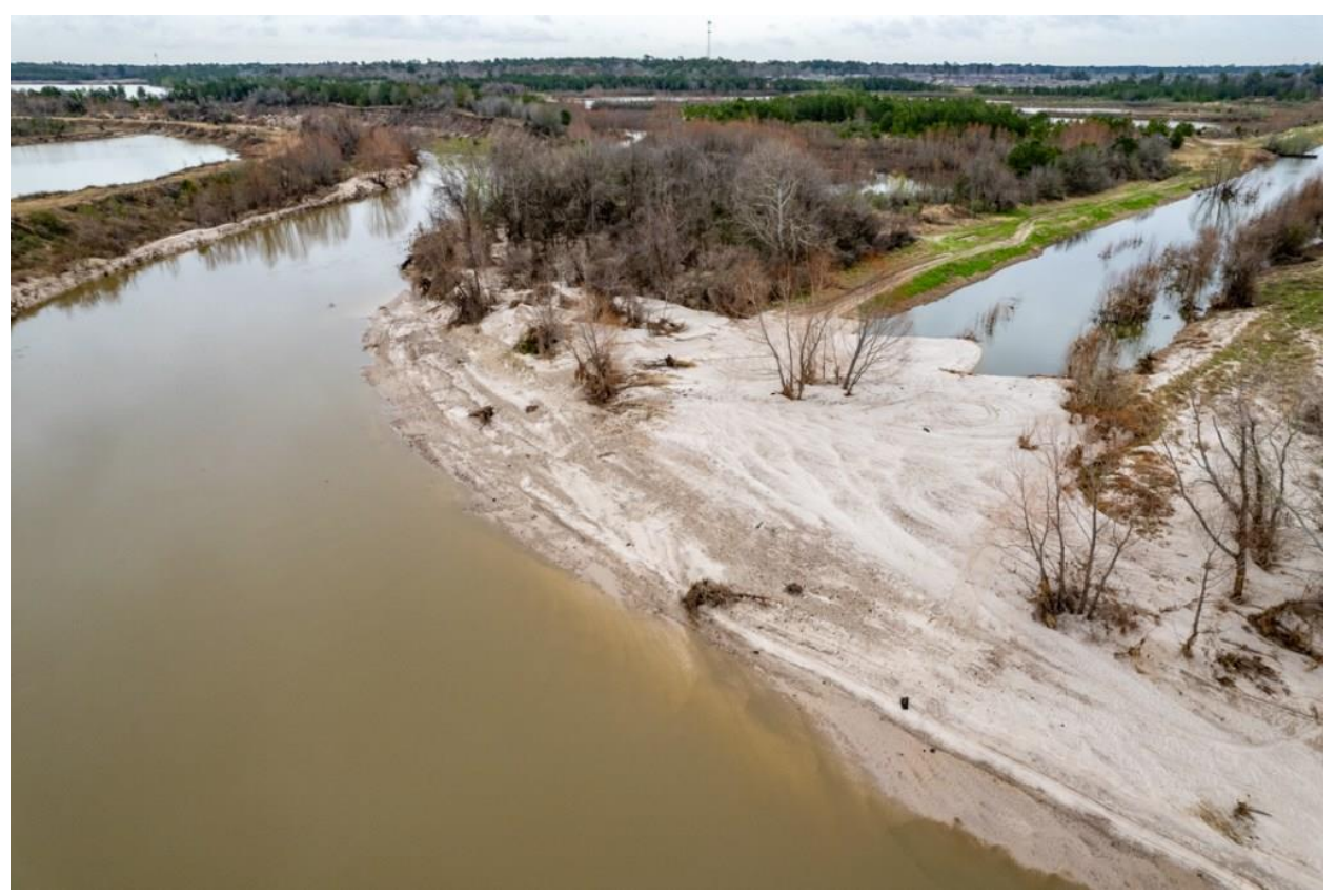
Same ditch blocked by sand increases flood risk for homes (visible in top right).