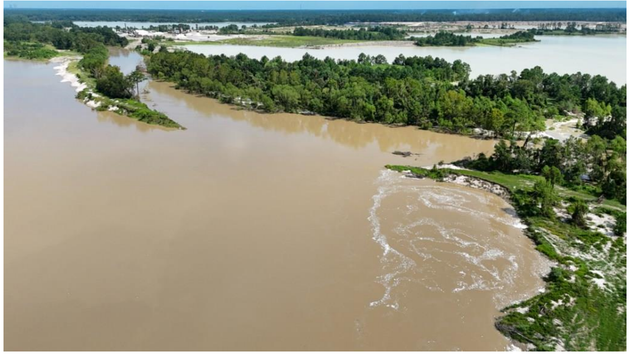
The West Fork now flows into the pit at the north end...