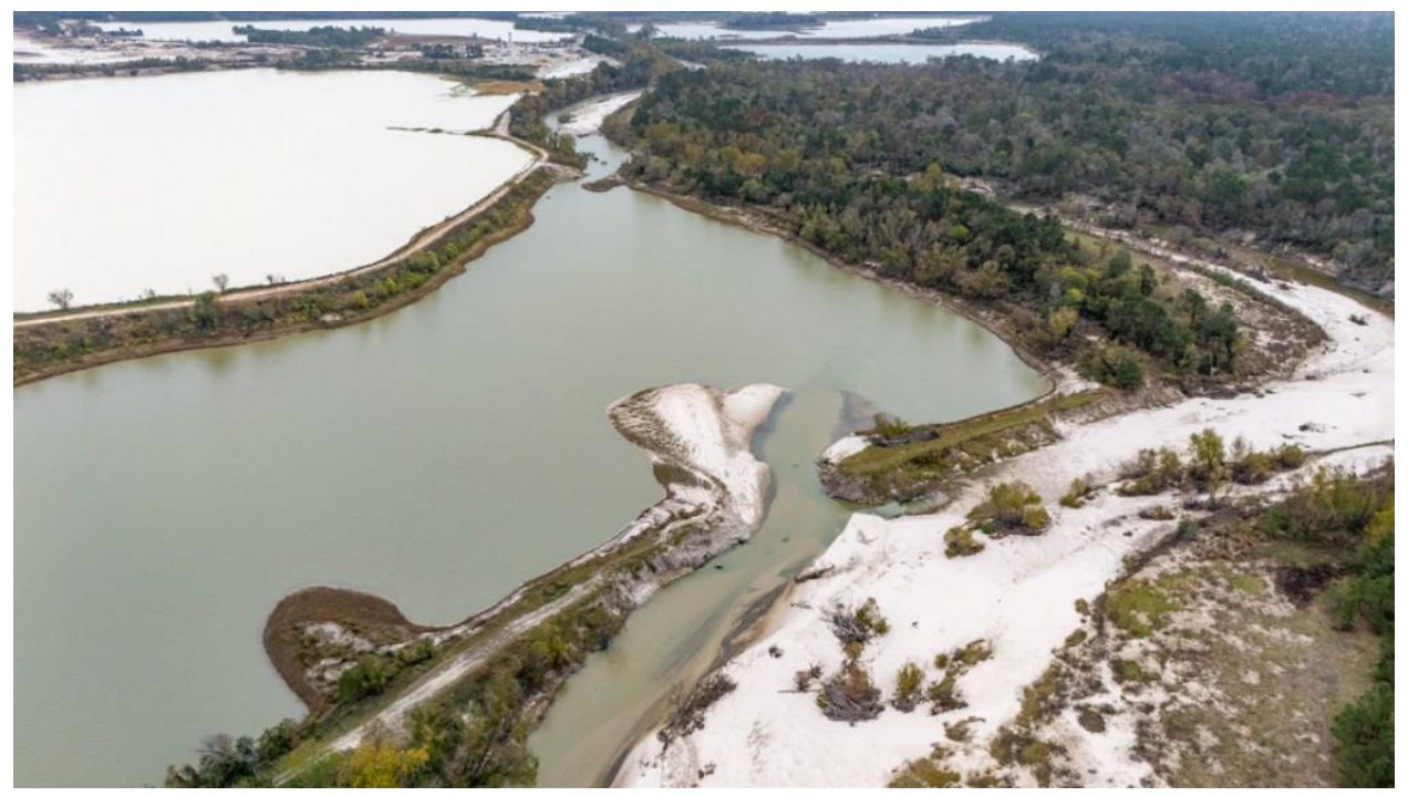
Another West Fork pit capture at the Hallett Mine after floodwaters receded. Notice how natural channel of the river has been virtually cut off.