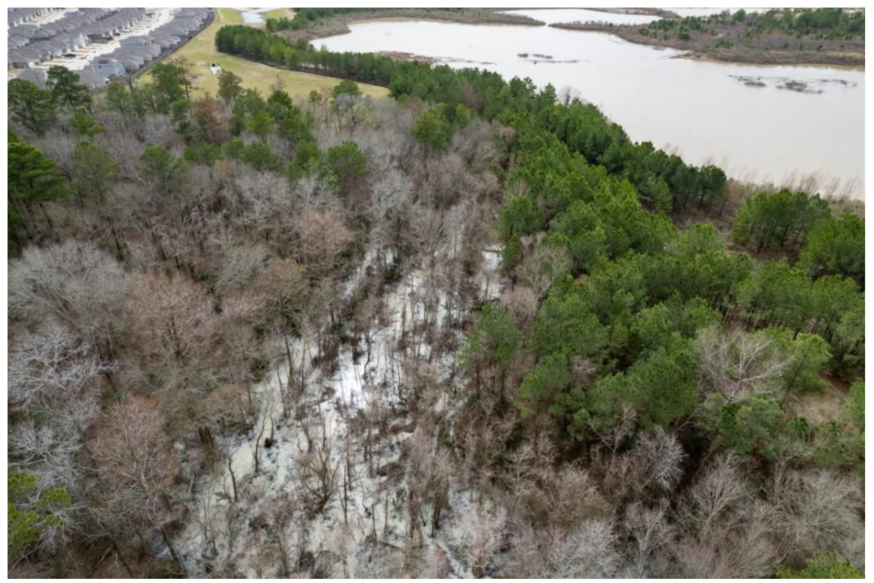
Effluent from the Hallett settling pond on San Jacinto West Fork escaping into adjacent property owned by others.