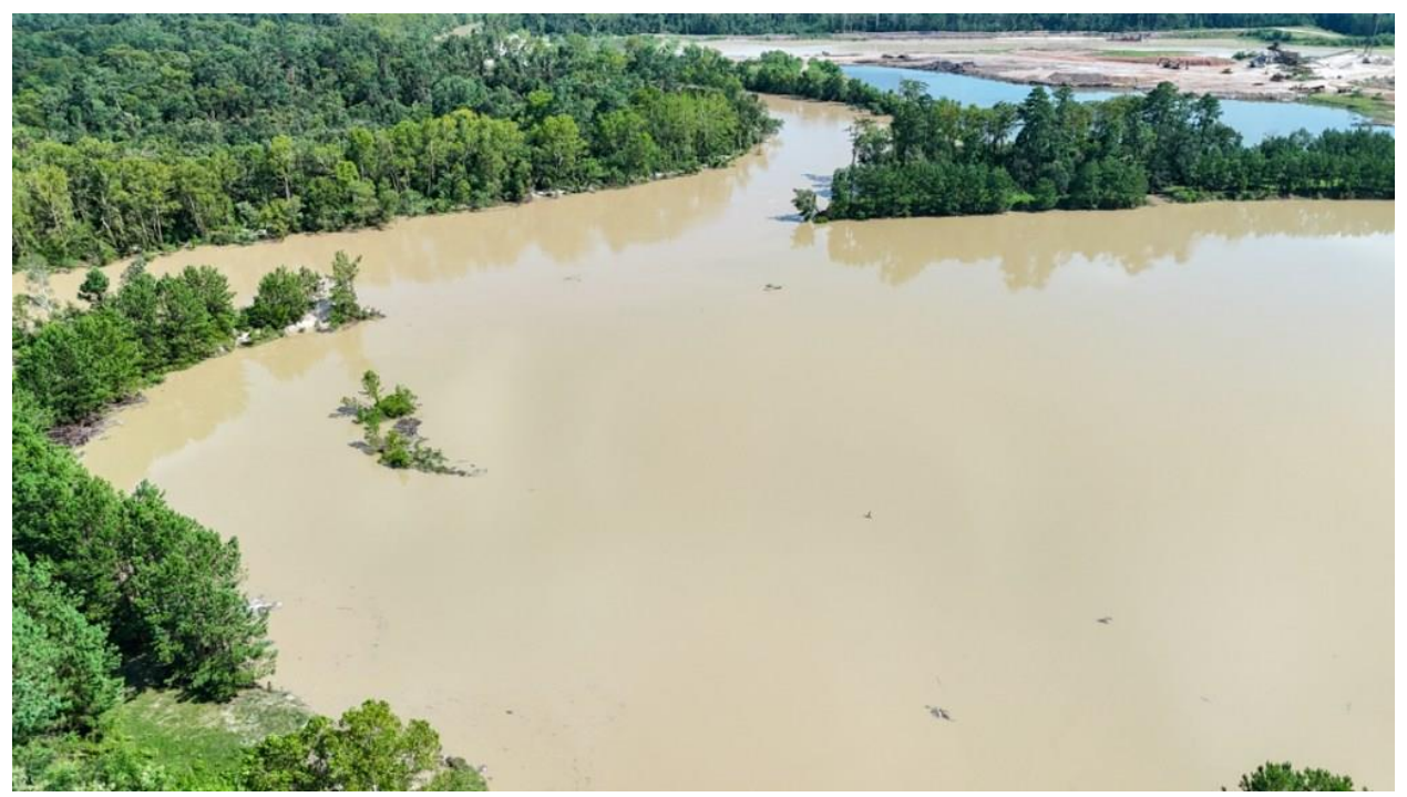
... Hurricane Beryl eroded what was left of the wall and flowed through the pit.