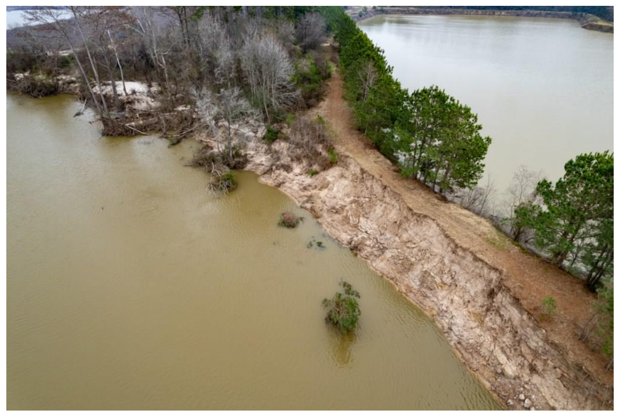
Dike of abandoned Williams Brothers Mine (upper right) eroded by the San Jacinto West Fork (lower left).