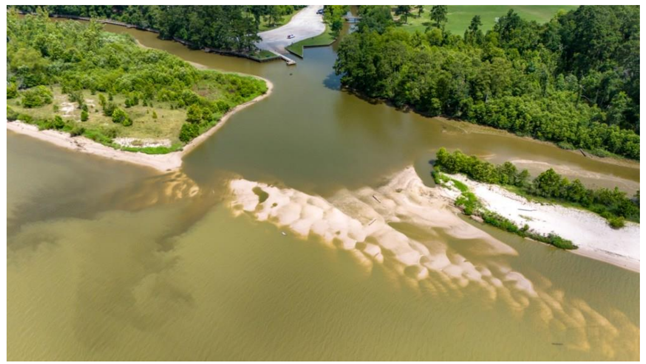
Farther downstream, the Kingwood Diversion Ditch (top middle) also became blocked by sediment. A Harris County Flood Control District study found that the <u>Diversion Ditch was one of the two most</u> <u>dangerous flooding problems</u> in Kingwood.

The entrance to this ditch had just recently been dredged by the Army Corps.