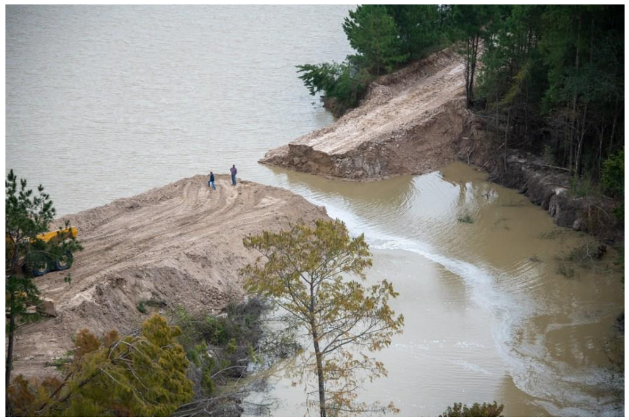
Broken dike at the Triple PG sand mine in Porter. Industrial wastewater is flowing out of the mine into White Oak Creek which joins Caney Creek and the San Jacinto East Fork before flowing into Lake Houston.

These pictures demonstrate that flooding of sand mines is a huge environmental problem in the Lake Houston Area. We have industrial waste increasing flood risk and polluting the drinking water supply for 2 million people. And the TCEQ BMPs don't even address the problem.