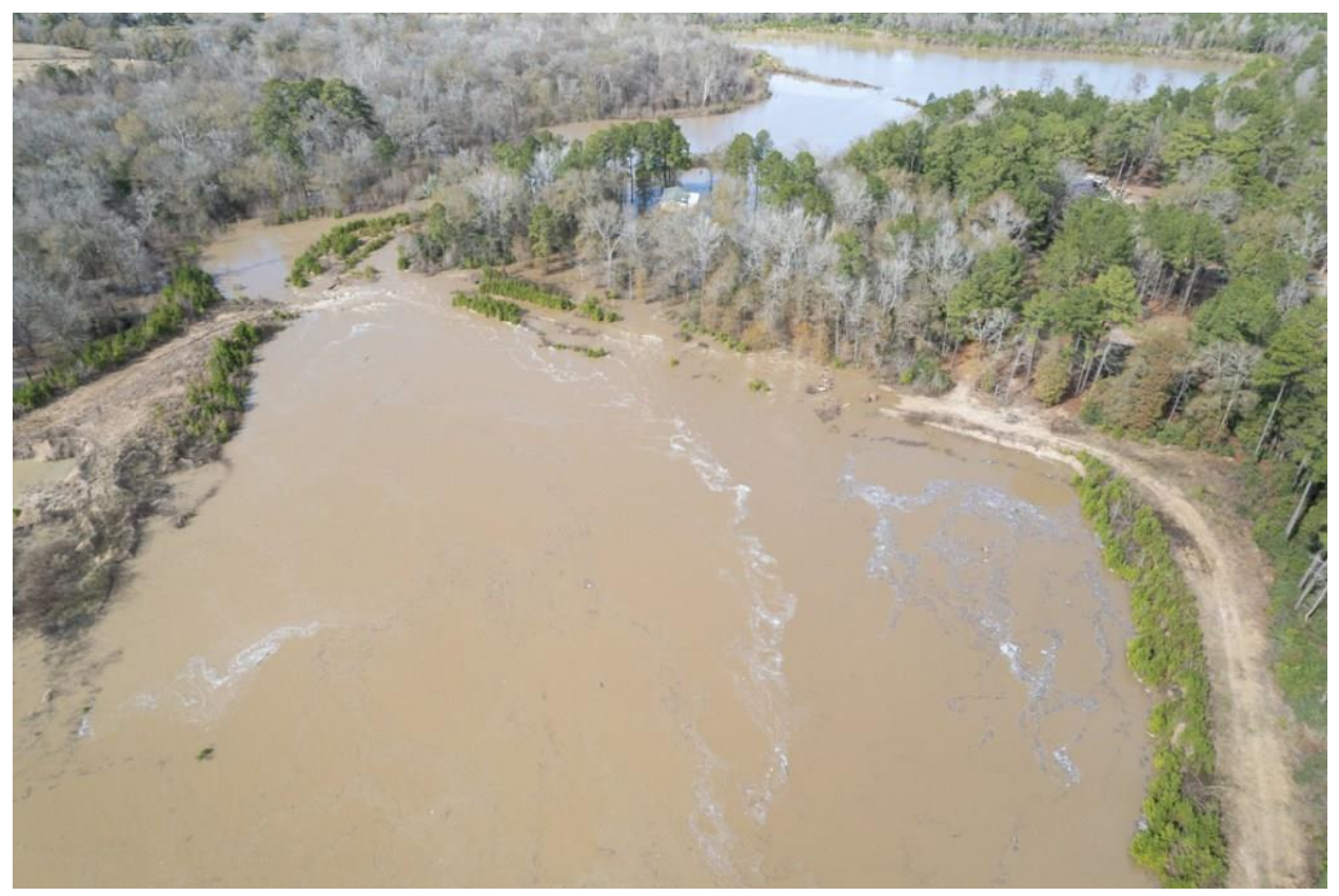
San Jacinto East Fork capturing a mine in Plum Grove.