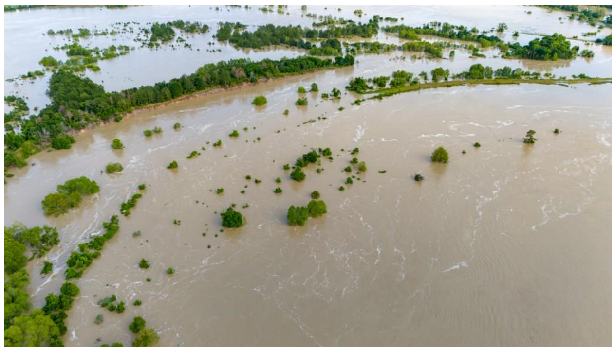
A drone followed logs floating through this captured West Fork pit at 5 MPH.

Miners claim their pits actually capture sand and keep it from floating downstream. That may be true at certain times during a flood, for instance, as it recedes. However, at the peak of the May 2024 flood, the speed of floodwater was sufficient to entrain sand in pits and carry it downstream.