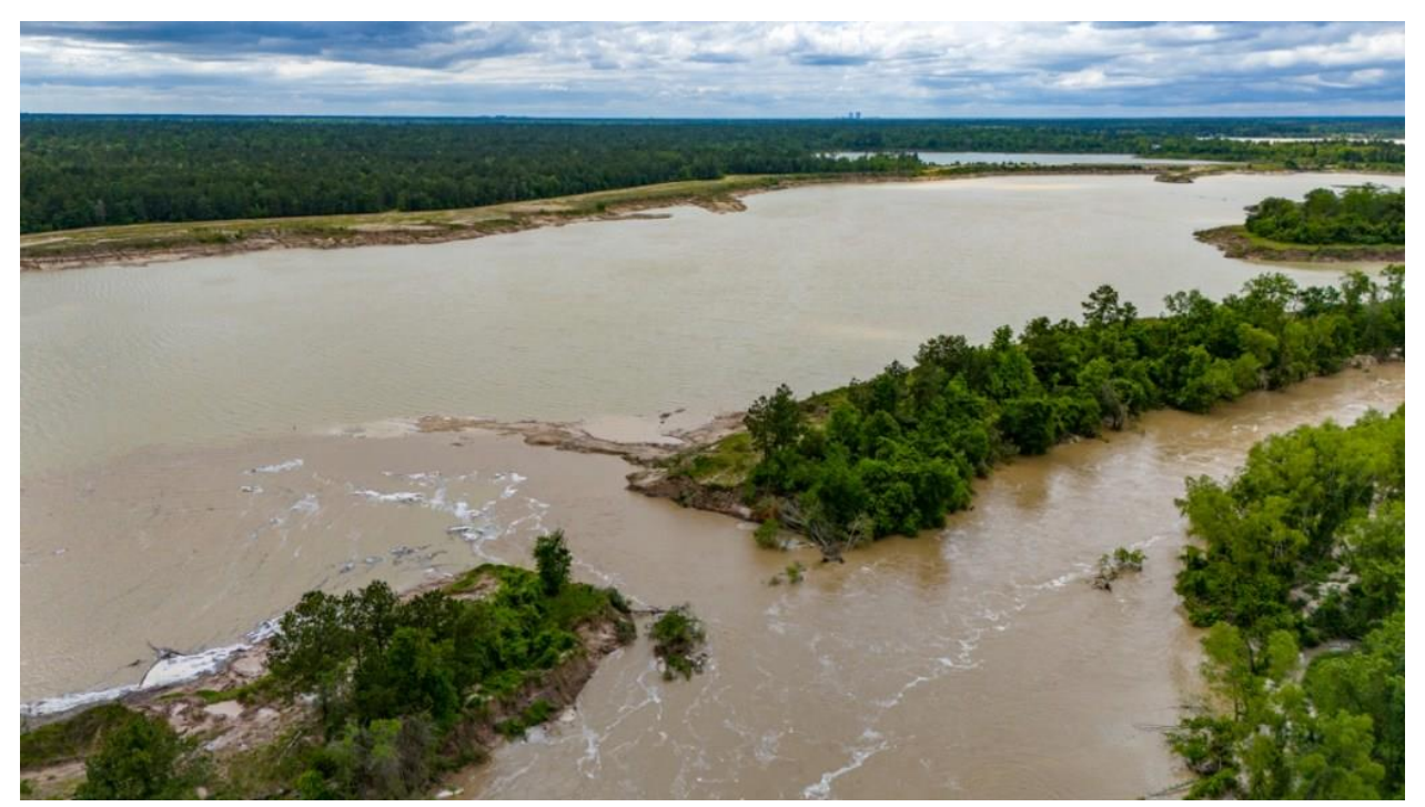
...and flows out at the south end.