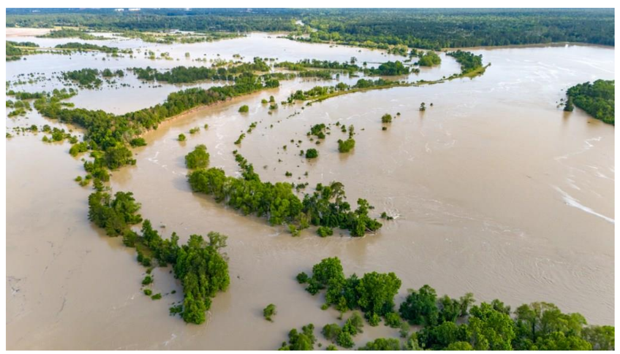
Wider shot of same pit (to the right of the S-turn) shows both the entry breach (lower right) and exit breach (upper right) in the dikes.