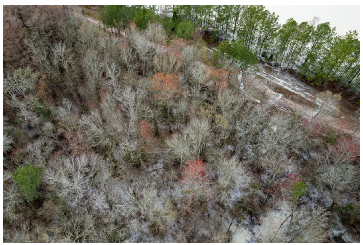
Close up of same effluent from same pond shows source of leakage.