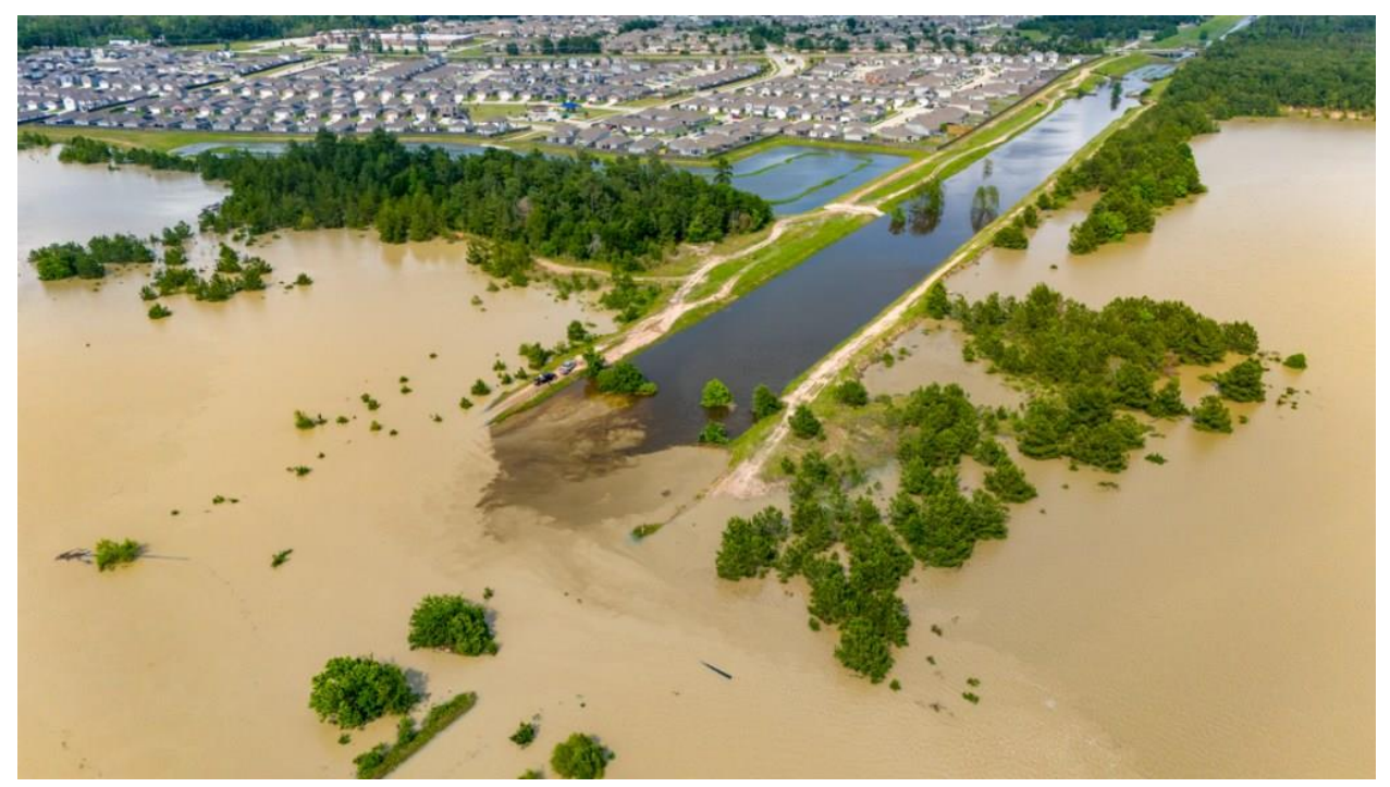
Reverse angle (facing east) shows proximity of pollution to homes in Northpark Woods subdivision. That's the Oakhurst Ditch, which empties into the West Fork behind camera position. Water flows left to right. Hallett mine is upstream on left.