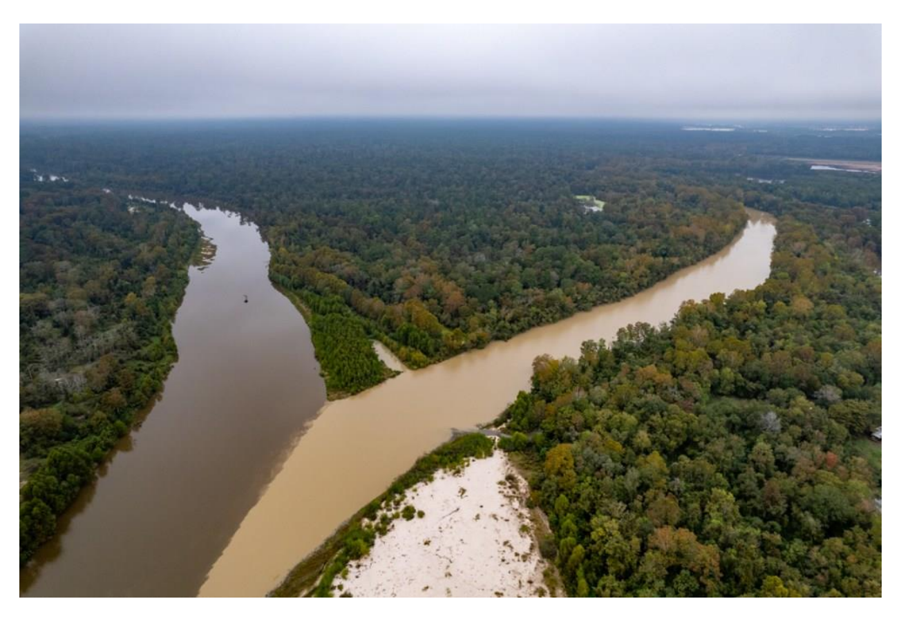
Confluence of San Jacinto West Fork (right) and Spring Creek near US59 Bridge. This is a frequent sight. Twenty square miles of mines are upstream on the right in a 20-mile reach of the river.