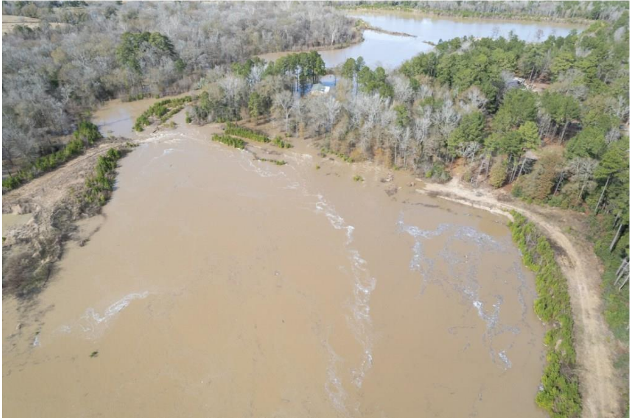
San Jacinto East Fork capturing a mine in Plum Grove.