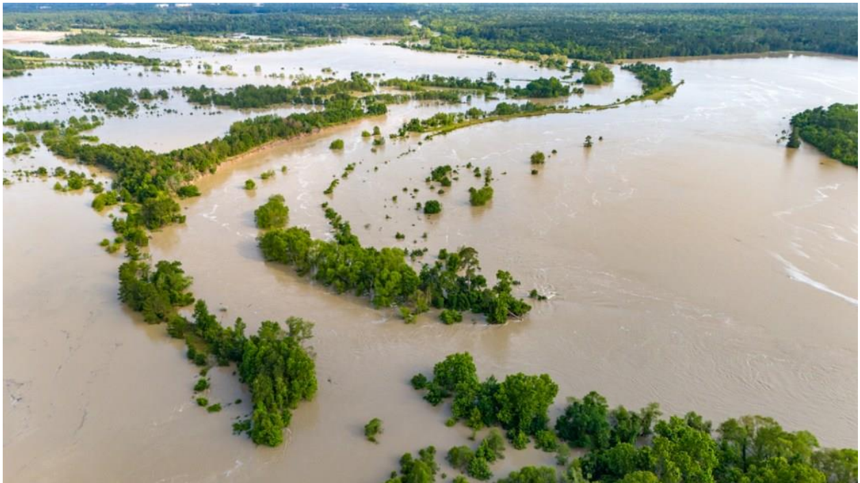
Wider shot of same pit (to the right of the S-turn) shows both the entry breach (lower right) and exit breach (upper right) in the dikes.