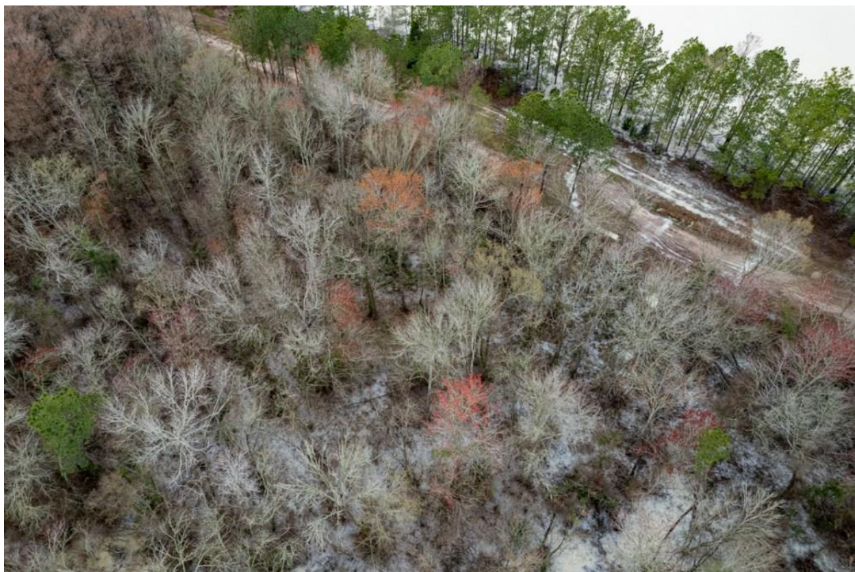
Close up of same effluent from same pond shows source of leakage.