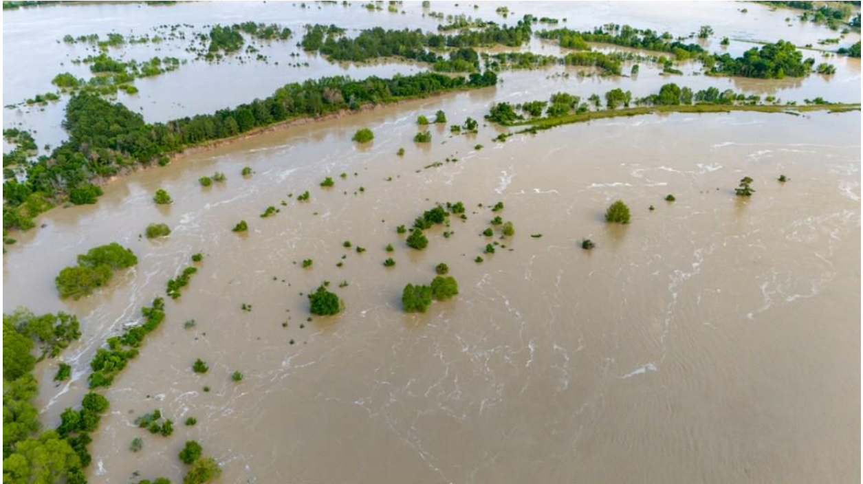
A drone followed logs floating through this captured West Fork pit at 5 MPH.

Miners claim their pits actually capture sand and keep it from floating downstream. That may be true at certain times during a flood, for instance, as it recedes. However, at the peak of the May 2024 flood, the speed of floodwater was sufficient to entrain sand in pits and carry it downstream.