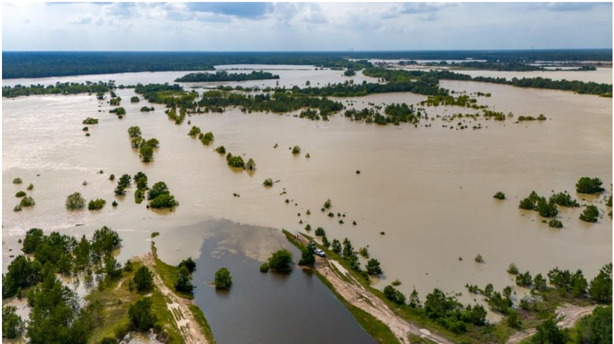
Effluent from the Hallett Mine (upstream in upper right) polluting the West Fork at the Northpark/Oakhurst Ditch (middle foreground). Water flows right to left. Facing West.