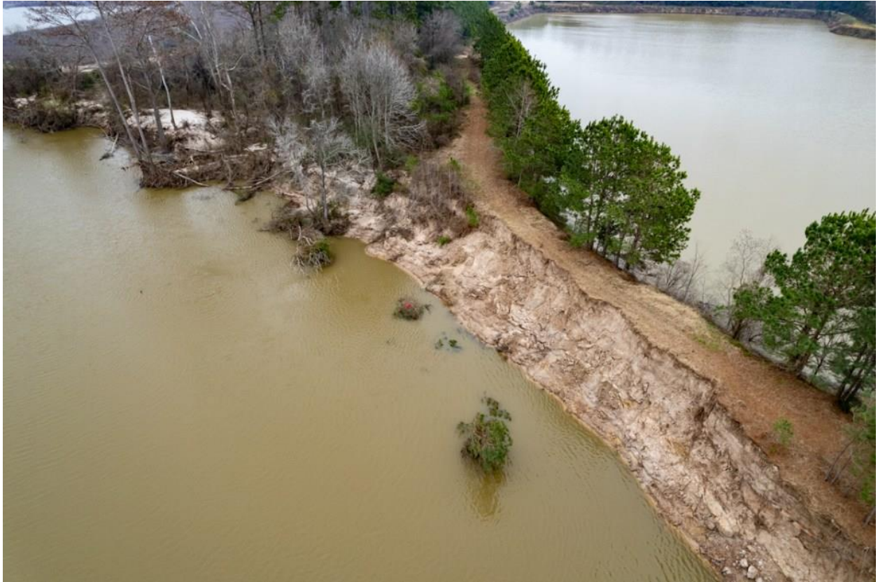
Dike of abandoned Williams Brothers Mine (upper right) eroded by the San Jacinto West Fork (lower left).