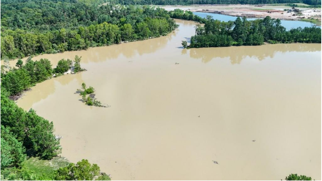
... Hurricane Beryl eroded what was left of the wall and flowed through the pit.