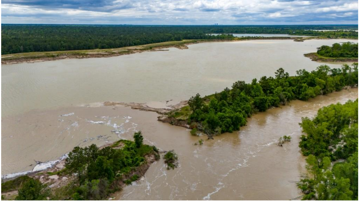
...and flows out at the south end.