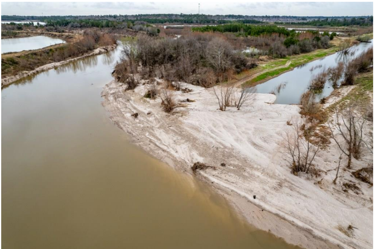
Same ditch blocked by sand increases flood risk for homes (visible in top right).