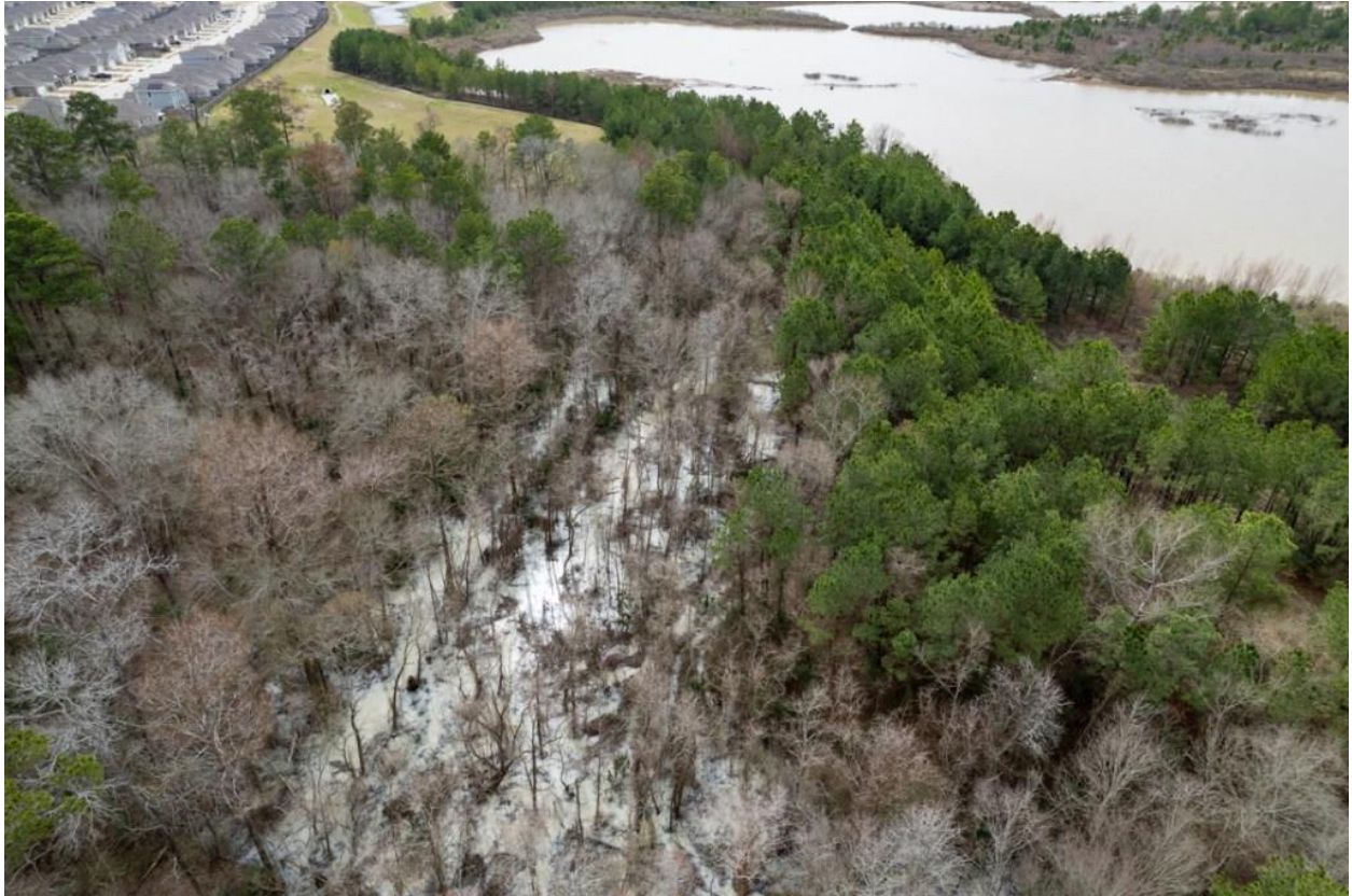
Effluent from the Hallett settling pond on San Jacinto West Fork escaping into adjacent property owned by others.