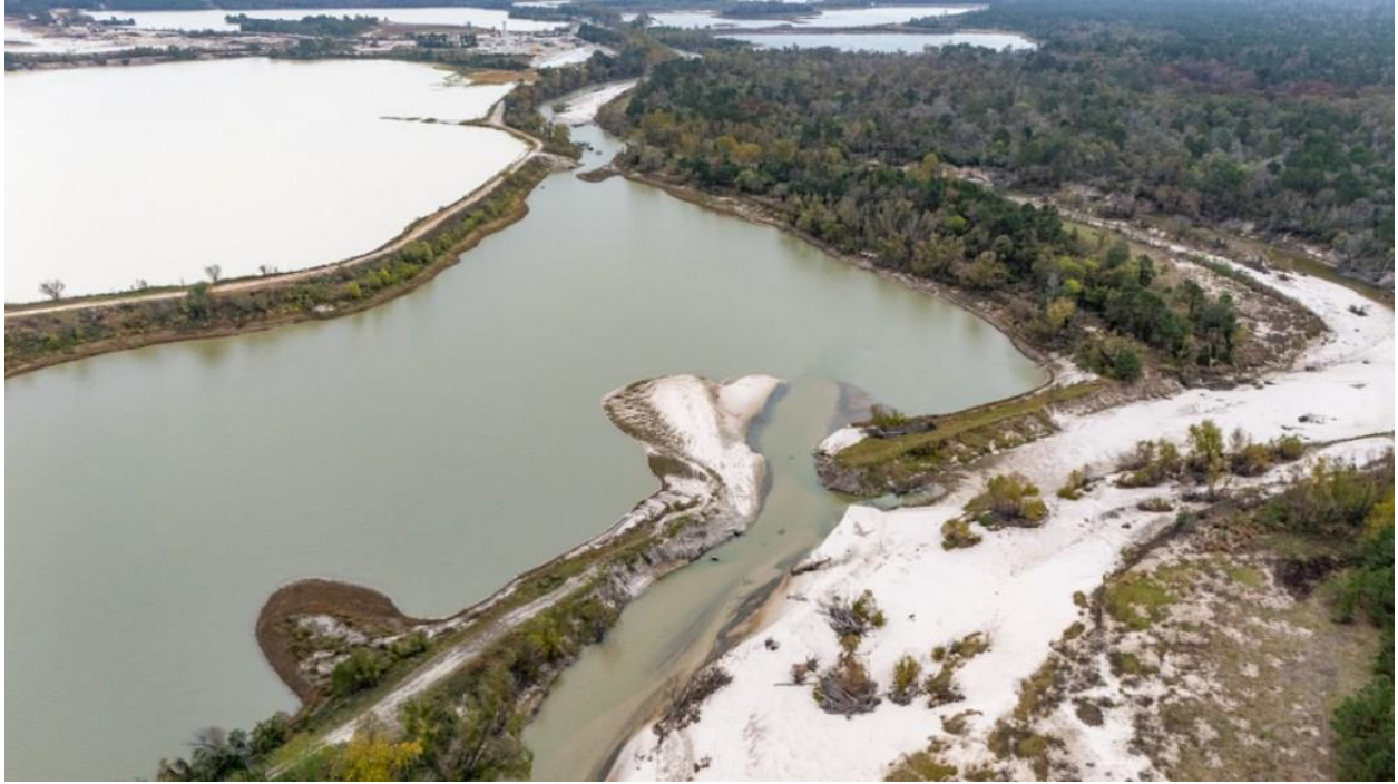
Another West Fork pit capture at the Hallett Mine after floodwaters receded. Notice how natural channel of the river has been virtually cut off.