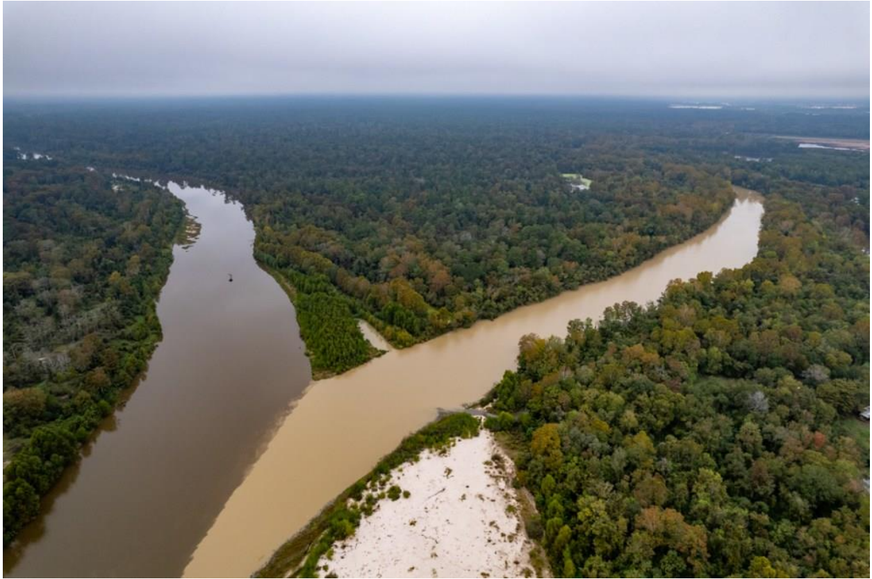
Confluence of San Jacinto West Fork (right) and Spring Creek near US59 Bridge. This is a frequent sight. Twenty square miles of mines are upstream on the right in a 20-mile reach of the river.