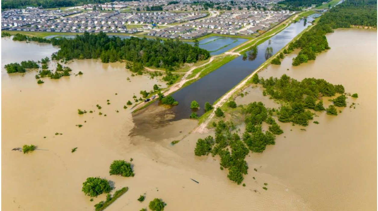
Reverse angle (facing east) shows proximity of pollution to homes in Northpark Woods subdivision. That's the Oakhurst Ditch, which empties into the West Fork behind camera position. Water flows left to right. Hallett mine is upstream on left.