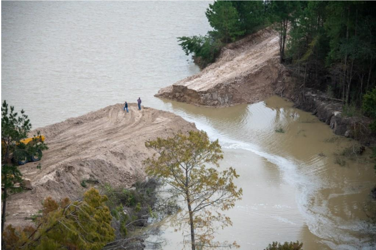
Broken dike at the Triple PG sand mine in Porter. Industrial wastewater is flowing out of the mine into White Oak Creek which joins Caney Creek and the San Jacinto East Fork before flowing into Lake Houston.

These pictures demonstrate that flooding of sand mines is a huge environmental problem in the Lake Houston Area. We have industrial waste increasing flood risk and polluting the drinking water supply for 2 million people. And the TCEQ BMPs don't even address the problem.