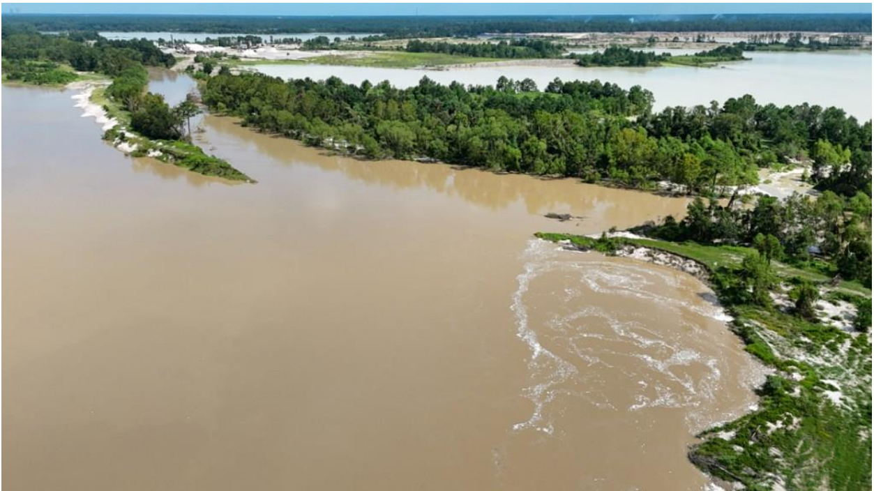
The West Fork now flows into the pit at the north end...