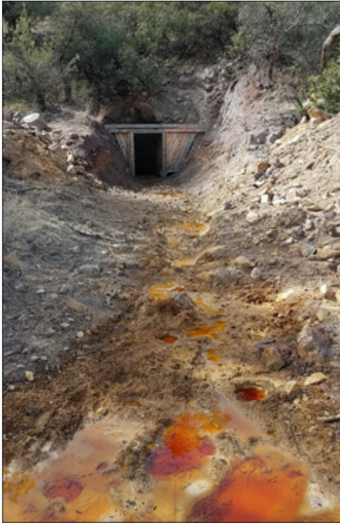
Figure 2. The adit at Lead Queen Mine, before remediation.

Entry to the open shafts were closed with bat-friendly gates, while others were sealed using polyurethane foam. A total of 11 zeolite gabion basket structures were installed in the stream channel at various locations downstream of the main adit in order to mitigate stormwater contact. However, the remedy at the main adit began to fail, allowing discharge of pollutants. USFS investigations discovered that the foam plug was intact, but that fractures and faults near the opening were seeping tunnel discharge that was then flowing downstream. USFS built a retention basin to contain and treat the small seep and flow. In 2019, USFS installed a hydraulic plug—a more long-term solution—to cease the discharge. Subsequent site visits confirmed no new seepage coming from the former adit opening.